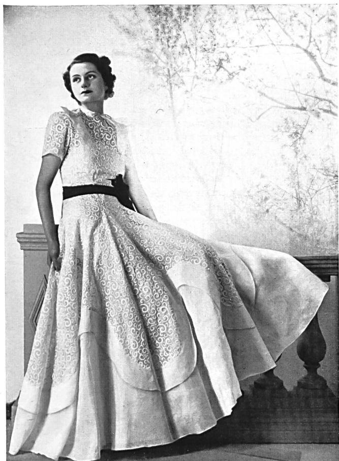
A Agnès Drecoll Model.

A certain Heim-Jeunes-Filles model is most desirable. It is of lawn embroidered with long wavy lines of drawn-thread work and is charmingly youthful. The skirt is short and full and flutes gracefully; the bodice, gathered at the waist