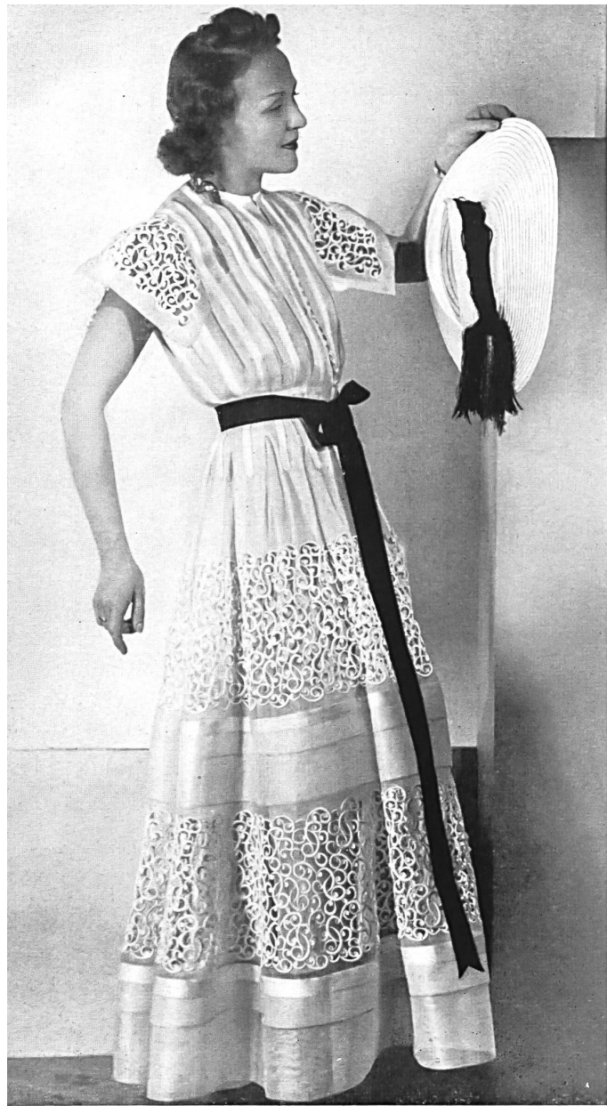
A Bruyère Model.

On the other hand, Paris designers have not committed the error of creating a « war style » or mere « uniforms », for with the new spring tailormade are worn charmingly feminine blouses of embroidered lawn or impeccable lingerie trimmings. This is a feature worthy of notice. The latest artistic creations of the embroidery industries of St. Gall — miracles of finest embroidered lawn and organdie, of lacy tulle and Venetian embroidery — harmonize delightfully with the Parisian sureness of taste and stress the sober elegance and quiet charm which are the keynotes of the new spring fashions.