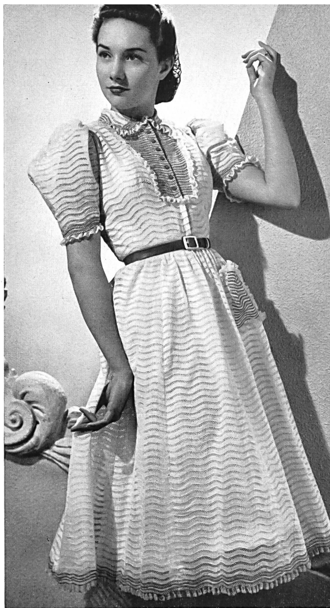
Afternoon frock in St. Gall embroidered lawn. A Heim Jeunes filles Model. Tissue of the firm Union S. A., St-Gall

and neck, is set off with a small turn-down collar embroidered with small red spots and edged with frilled Valenciennes. This same trimming is used round the hem and on a little pocket perched on the left side of the skirt. A narrow belt completes the simple and very youthful trimming.