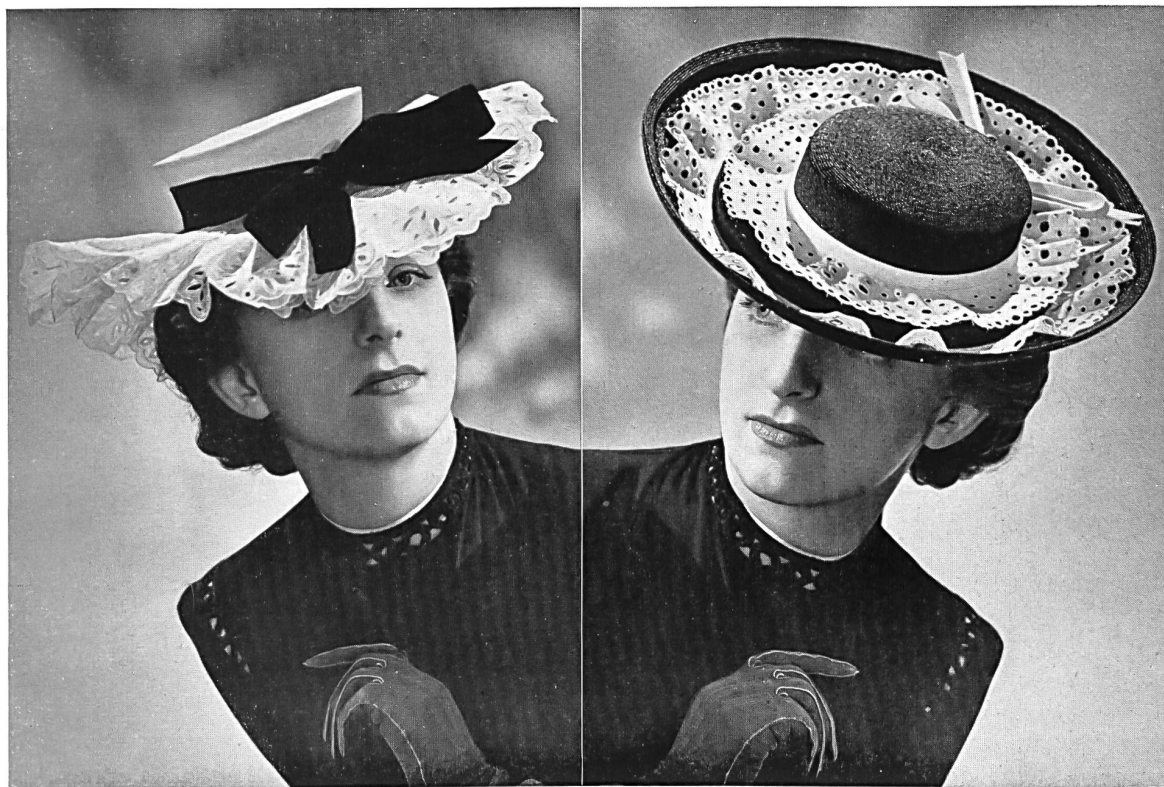
Trimming of St Gall embroidered organdie