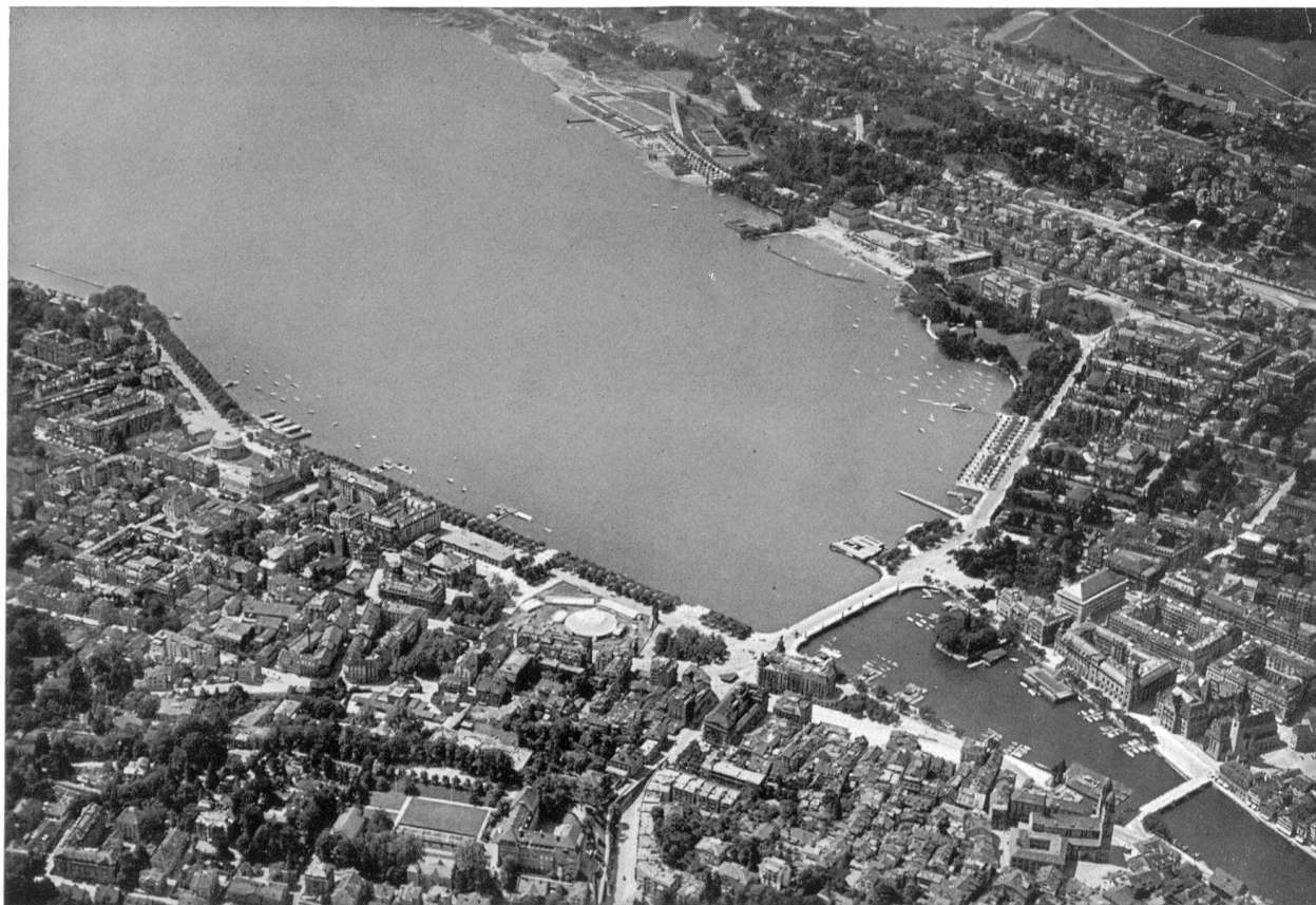
The shores of the Lake of Zurich where the Exhibition will be held

At any rate Swiss industries are preparing to concentrate every effort on making their products known to as wide a circle as possible, for the importance and diversity of Swiss manufactures are