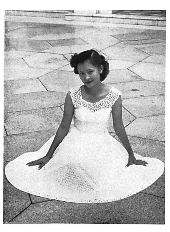
Eyelet embroidery on batiste and on organdy by Chr. Fischbacher Co., (Courtesy of Berli, Jucker & Co., Bangkok.)