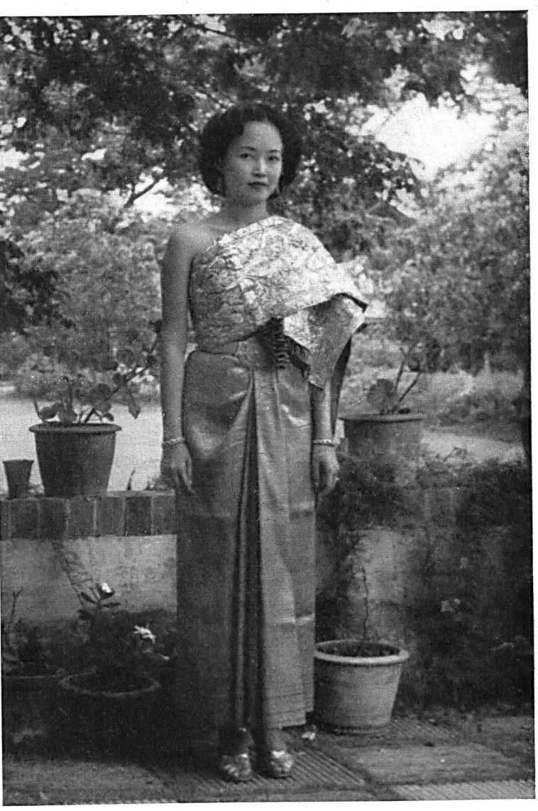
National Siamese costume of the reign of King Mongkut.

when completed as above, would give the appearance in front something like Turkish trousers. This method was used for everyday and informal wear by women.