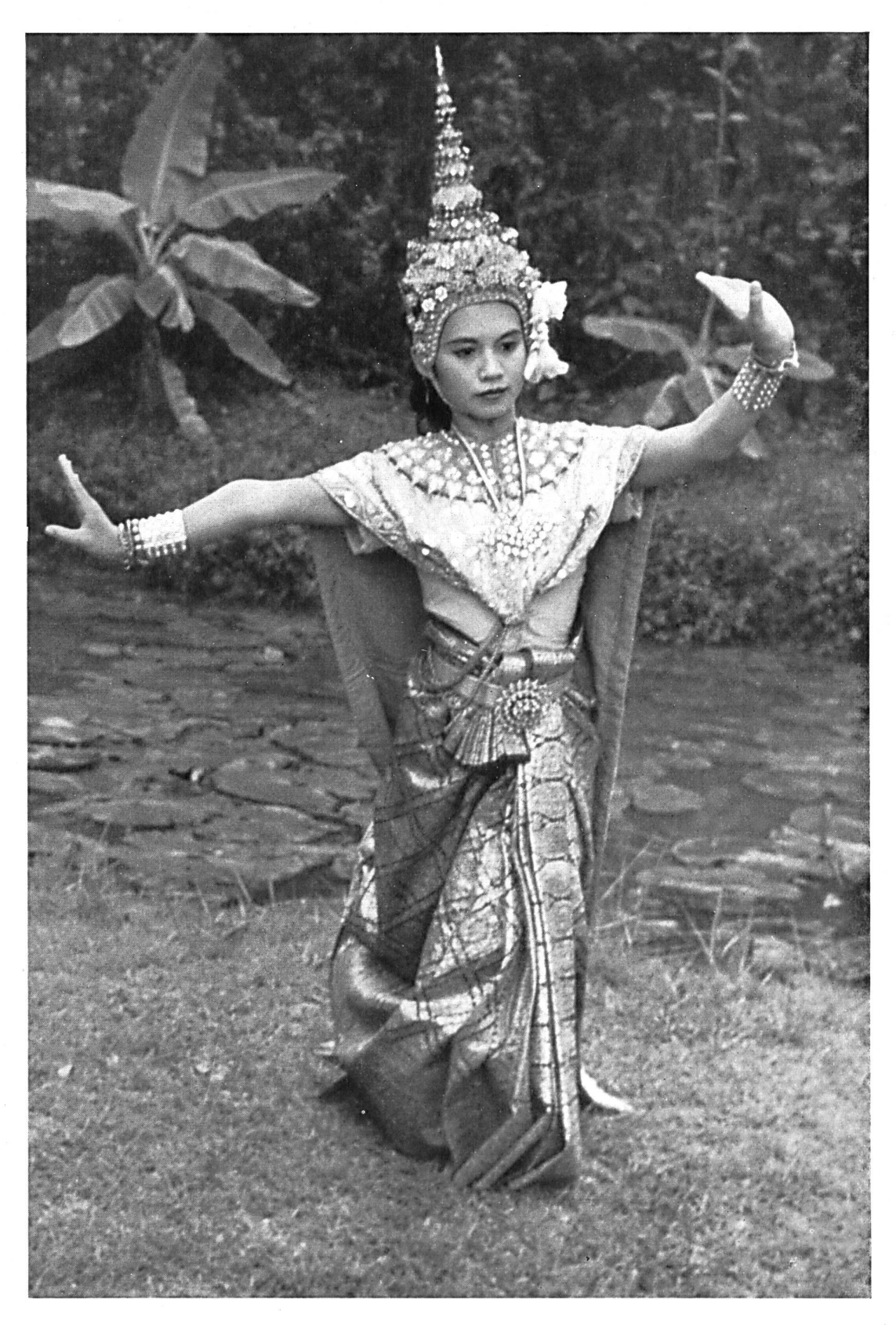
Classical costume for the theatre.