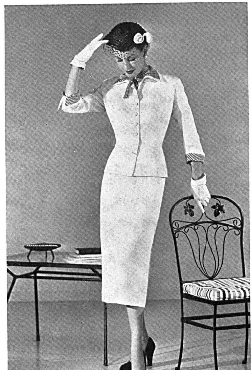
ATHENA White suit of Swiss synthetic fabric