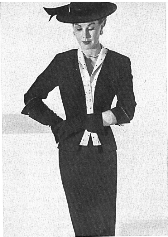
ATHENA Swiss shantung suit with linen insert

This is a season of potpourri — of a rehash of old ideas, of a return to many design lines of the late thirties, a season when anything goes and most of it will.