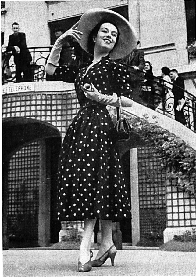
Auteuil : Grand steeple-chase. Robe de Maggy Rouff.

almost identical jackets go off towards the start at the Carrefour des Cascades... Another race is about to begin.