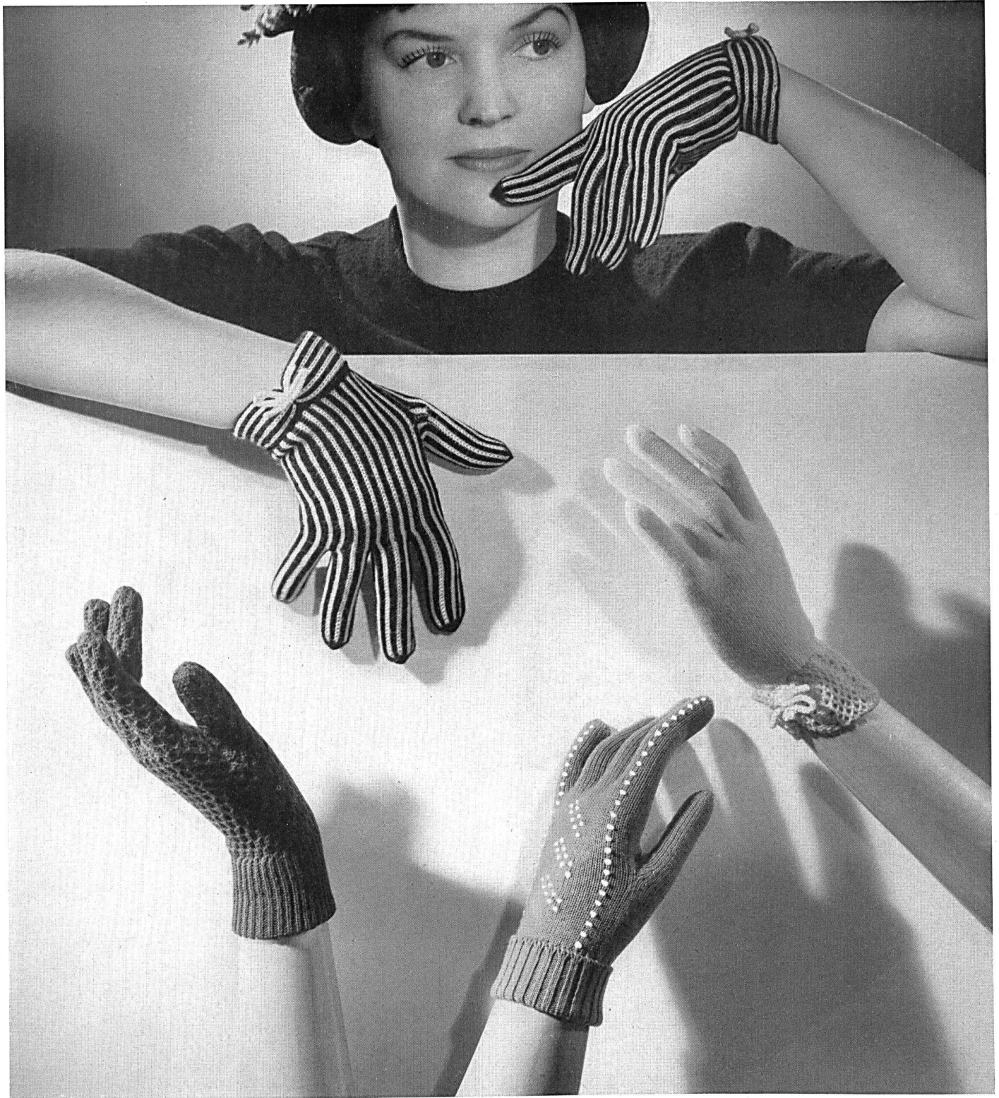
E. Frey-Gätzi S. A., Degersheim Gants de laine tricotés, pour dames. Knitted woollen gloves for ladies. Guantes de punto de lana, para señora. Gestrickte wollene Damenhandschuhe.