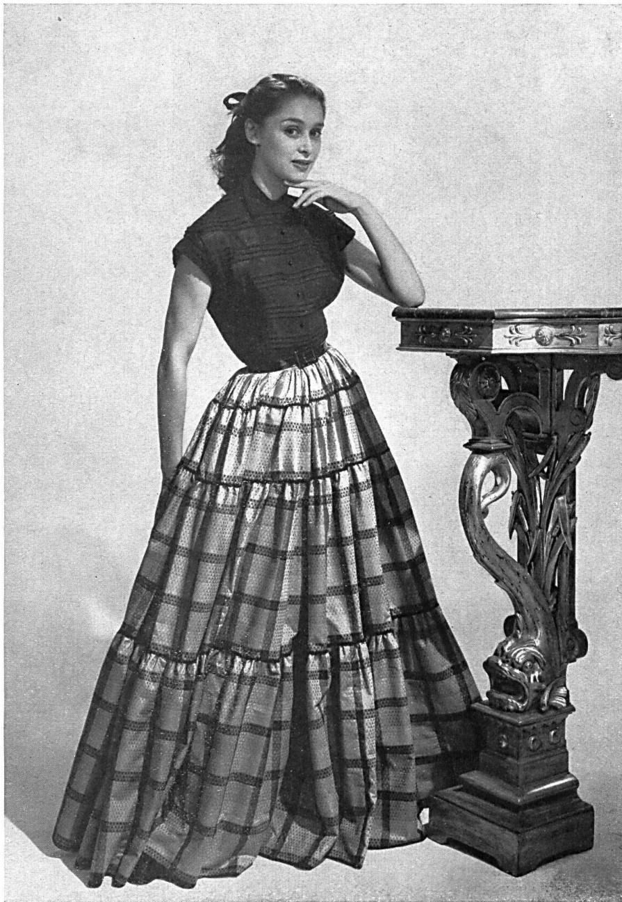
Fancy fabrics of fine Nelo cotton, equally popular in Siam and in Europe, by J.G. Nef & Co., Herisau. Model BALMAIN.

remote parts of the country or the resplendent costumes to be seen at theatrical performances, reminiscent of the splendid pageantry of old, cause the visitor to appreciate all the more the splendor of the Siamese costumes, and there can be not the slightest doubt that in the days of Anna and the King of Siam the sight of a crowd presented a magnificent scene. Now and again it is still possible to see some high dignitary or dignified lady wearing the traditional attire, but they belong to the past.