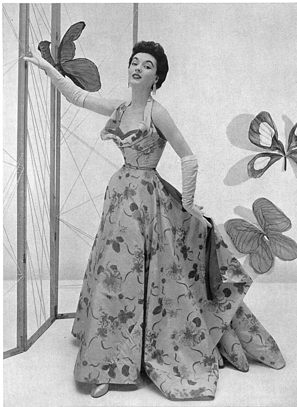
Multicoloured flower design on warp printed pure silk taffeta.