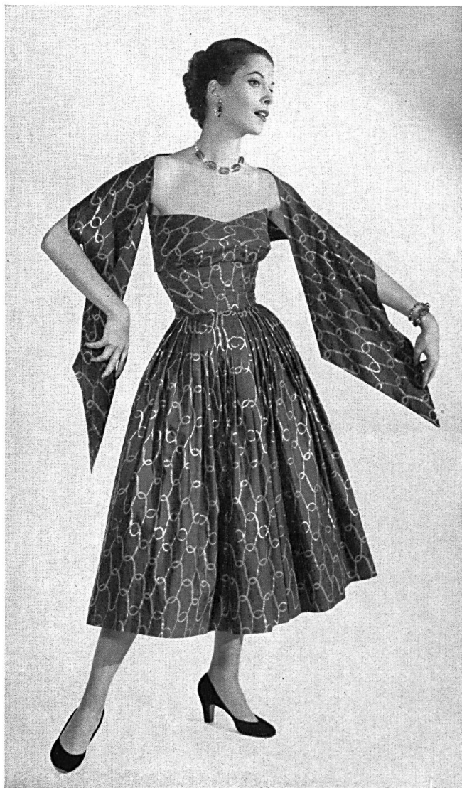
SWISS FABRIC GROUP, NEW YORK