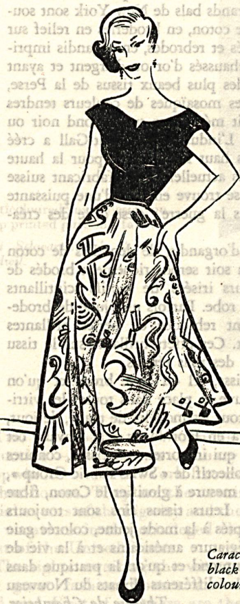
Characteristic line of this season: black bodice and skirt with bright colours on a clear background.

Let us take, for example, the field of printed fabrics.