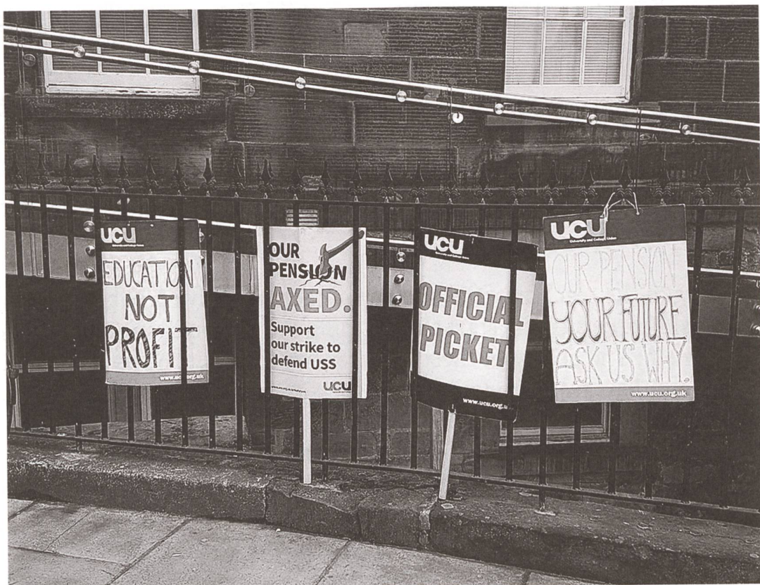
(fig. b) 2018 UK higher education placards at the University of Edinburgh.