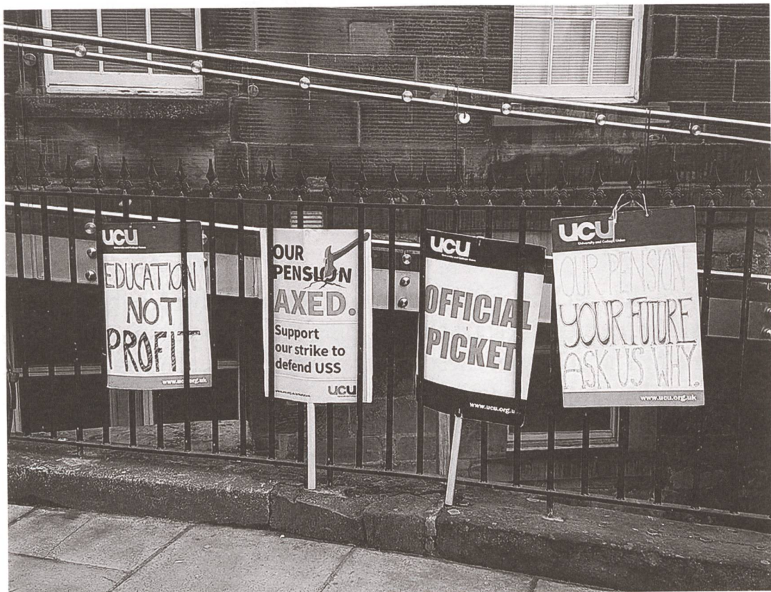
(fig. b) 2018 UK higher education placards at the University of Edinburgh.