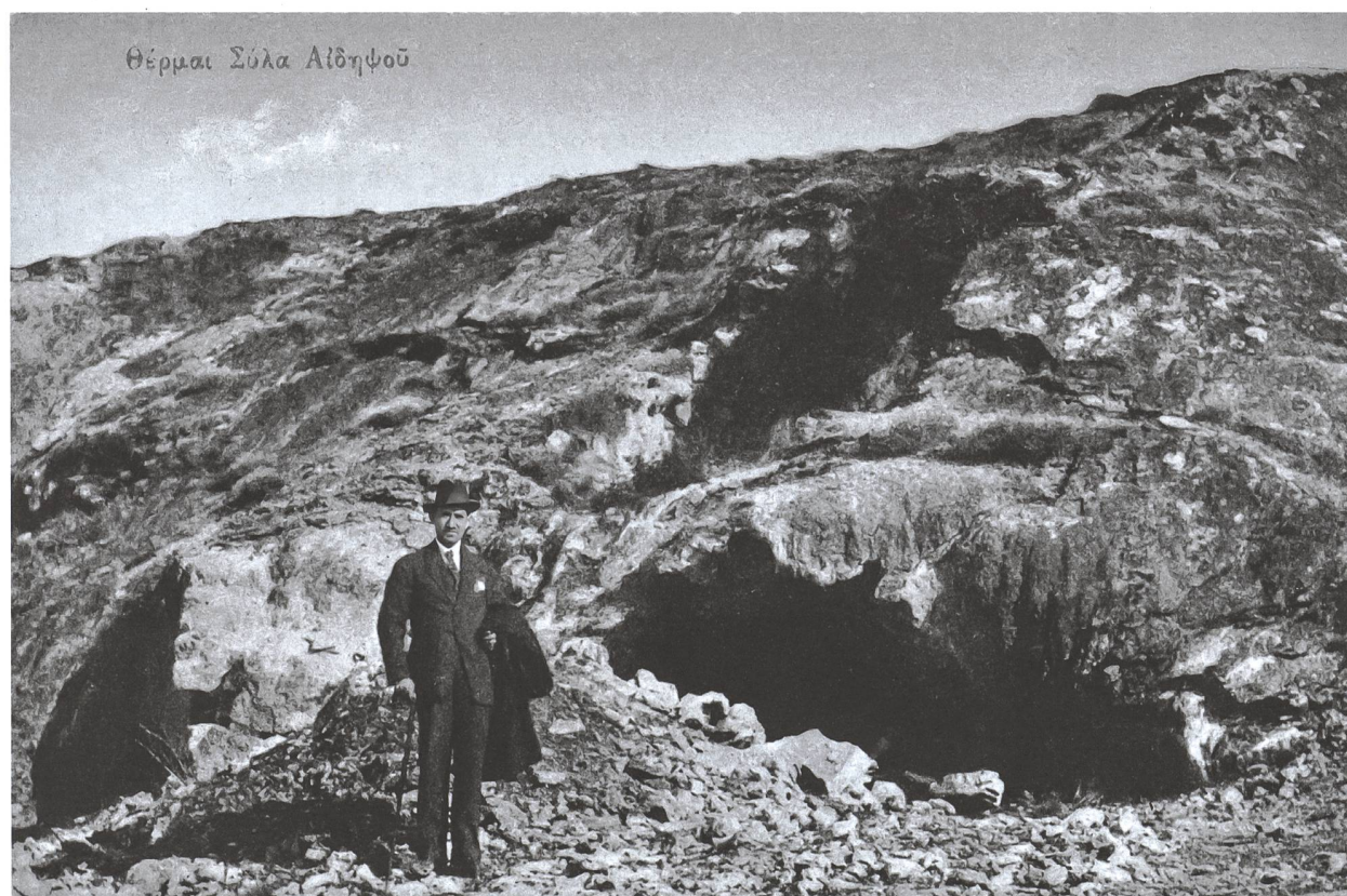
(fig. c) The mineral springs in Aidipsos.