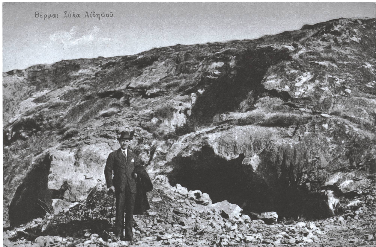
(fig. c) The mineral springs in Aidipsos.