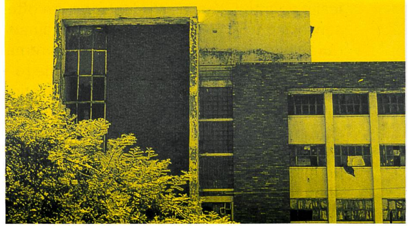
A OFFICE KGDVS, Border crossing, Anapra MEX-USA, 2005 C Ant3nio de Cunha Telles, Indios da Meia Praia, 1975