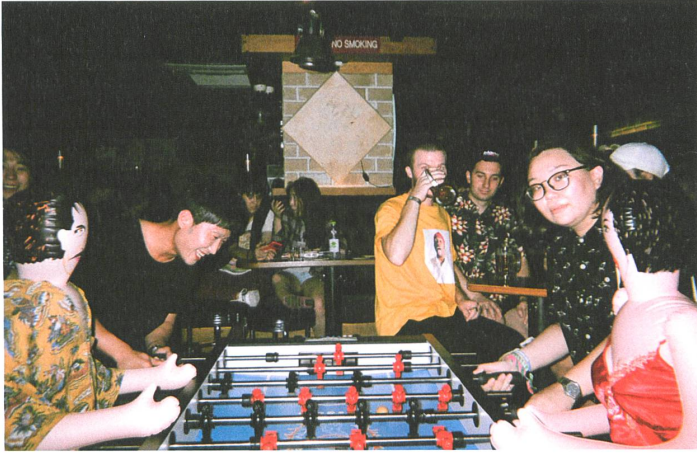
#94 Seoul, South Korea, Seogyo-Dong district 29.07.2017