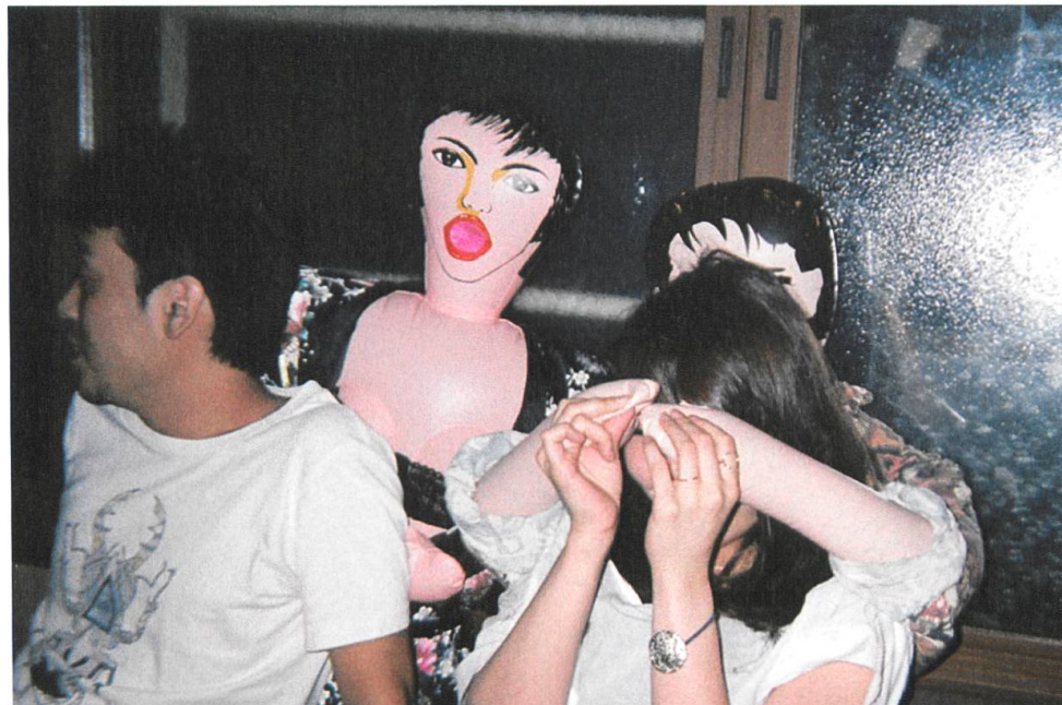
#78 Tokyo, Japan, Shinjuku 28.05.2017