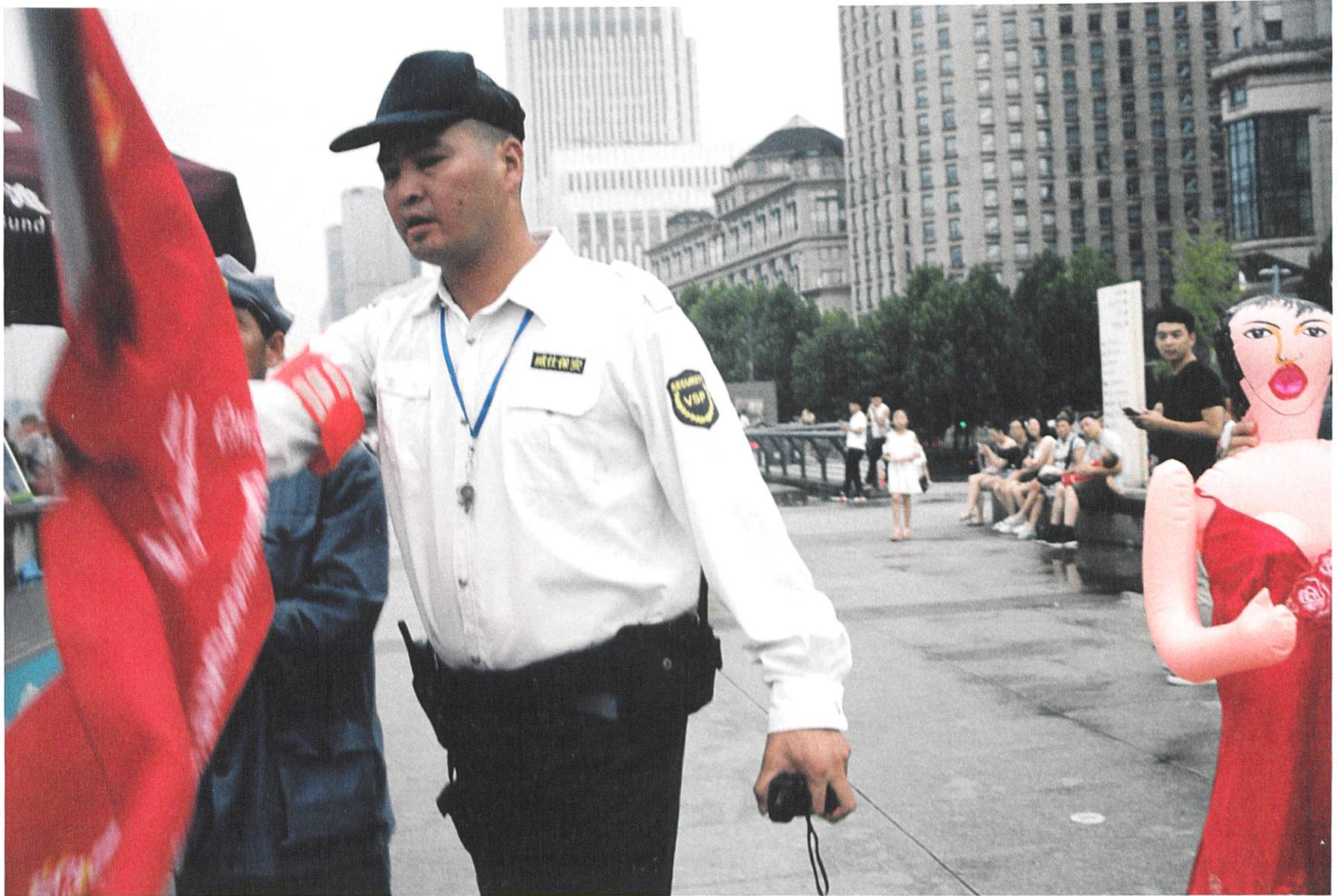
#120 Shanghai, China, The Bund 25.08.2017