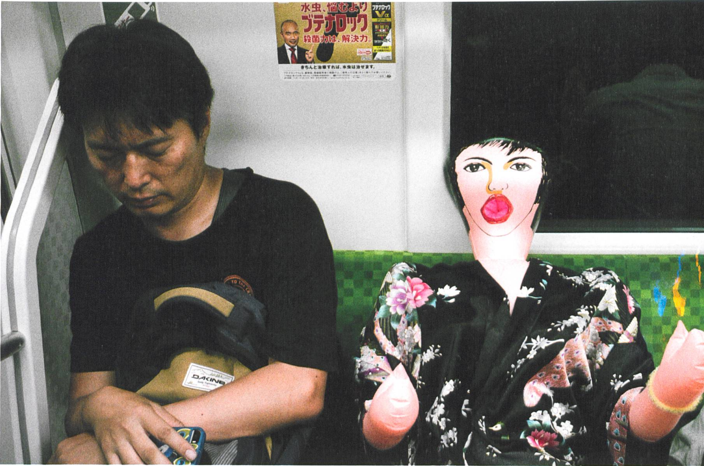
#79 Tokyo, Japan, Metro for Yokohama 28.05.2017