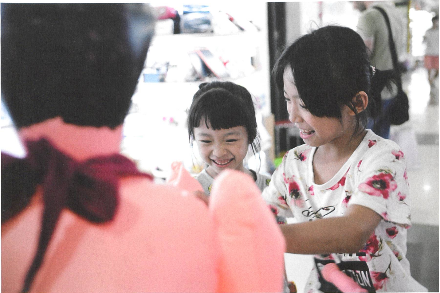
#221 Yiwu, China 19.08.2017