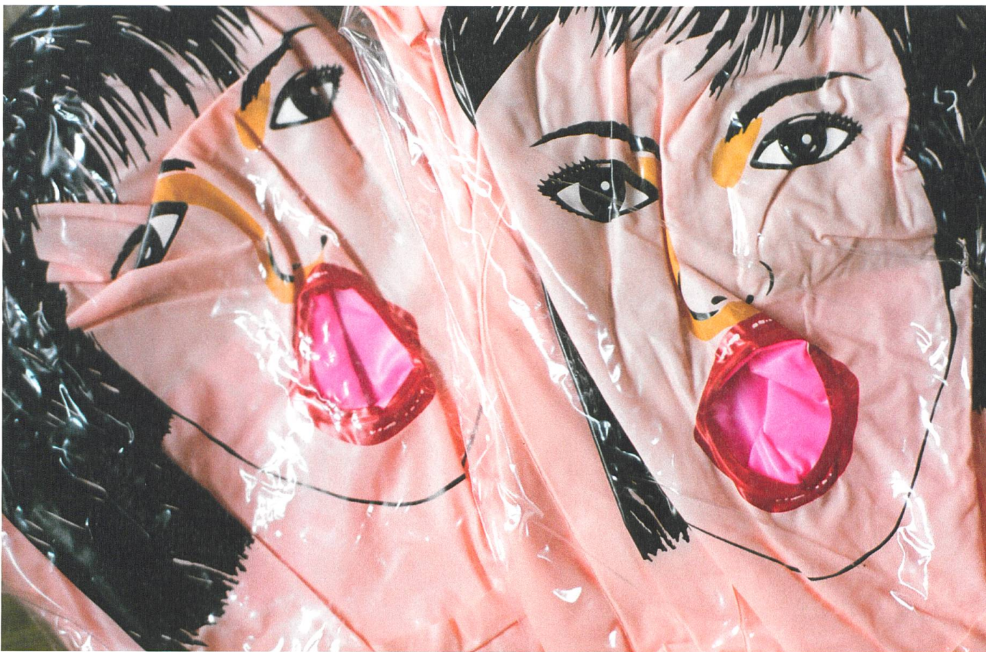
#116 Yiwu, China, Yiwu Mart Toys Factory 24.08.2017