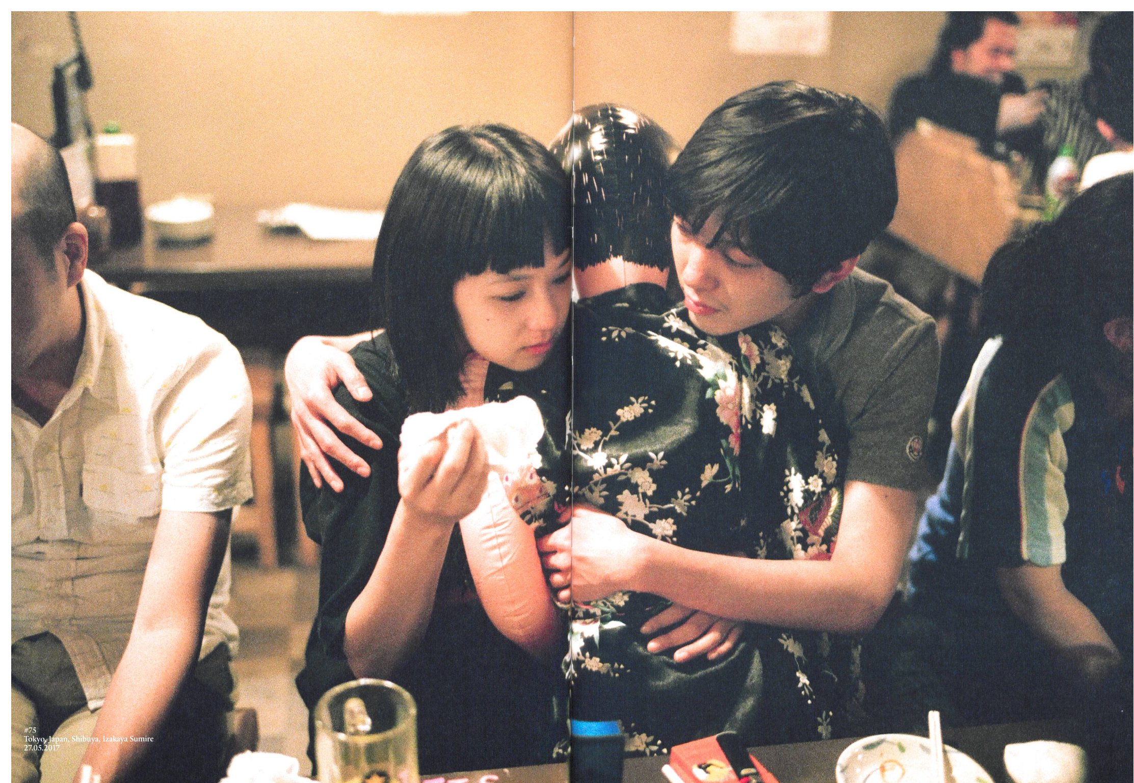
#75 Tokyo, Japan, Shibuya, Izakaya Sumire 27.05.2017