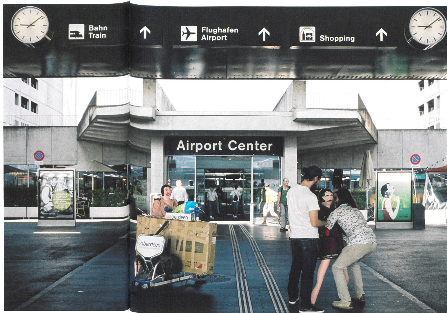
#131 Zürich, Switzerland, Bus Station Airport 01.09.2017