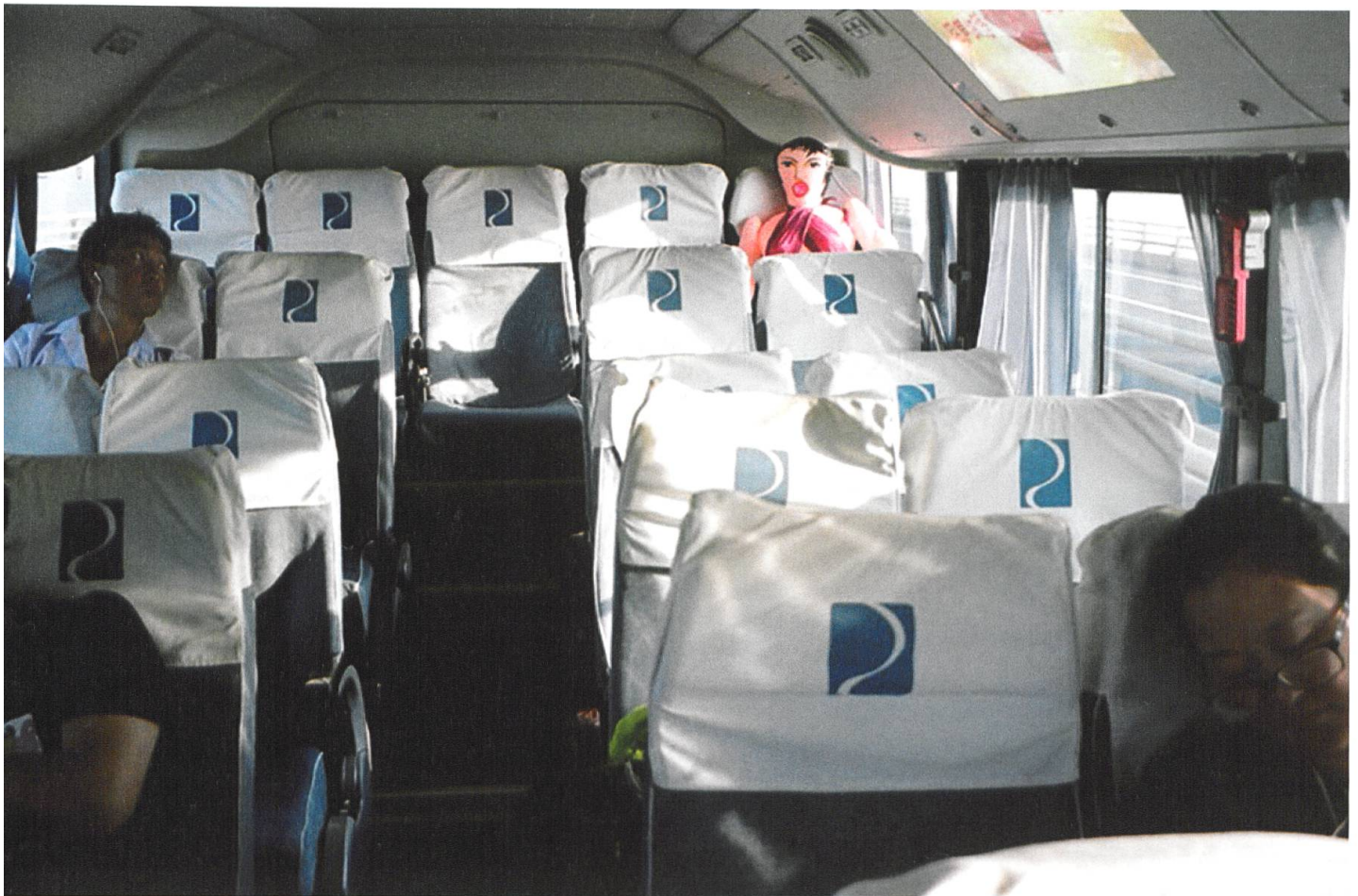
#122 Shanghai, China, Bus for Yiwu 21.08.2017