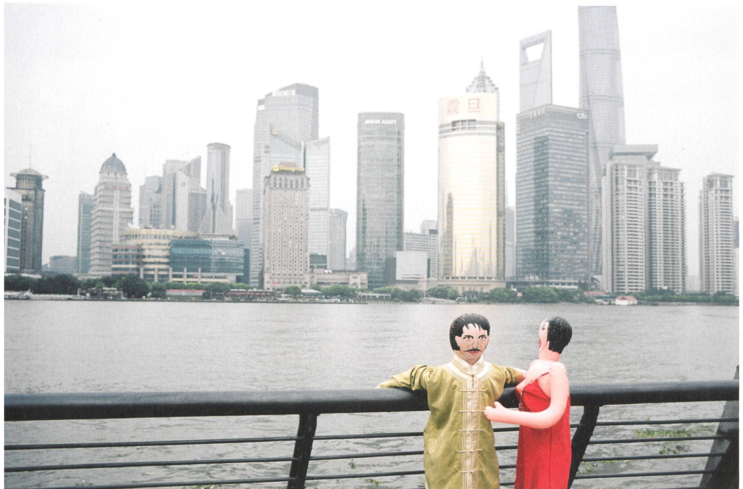
#122 Shanghai, China, View of Pudong 25.08.2017