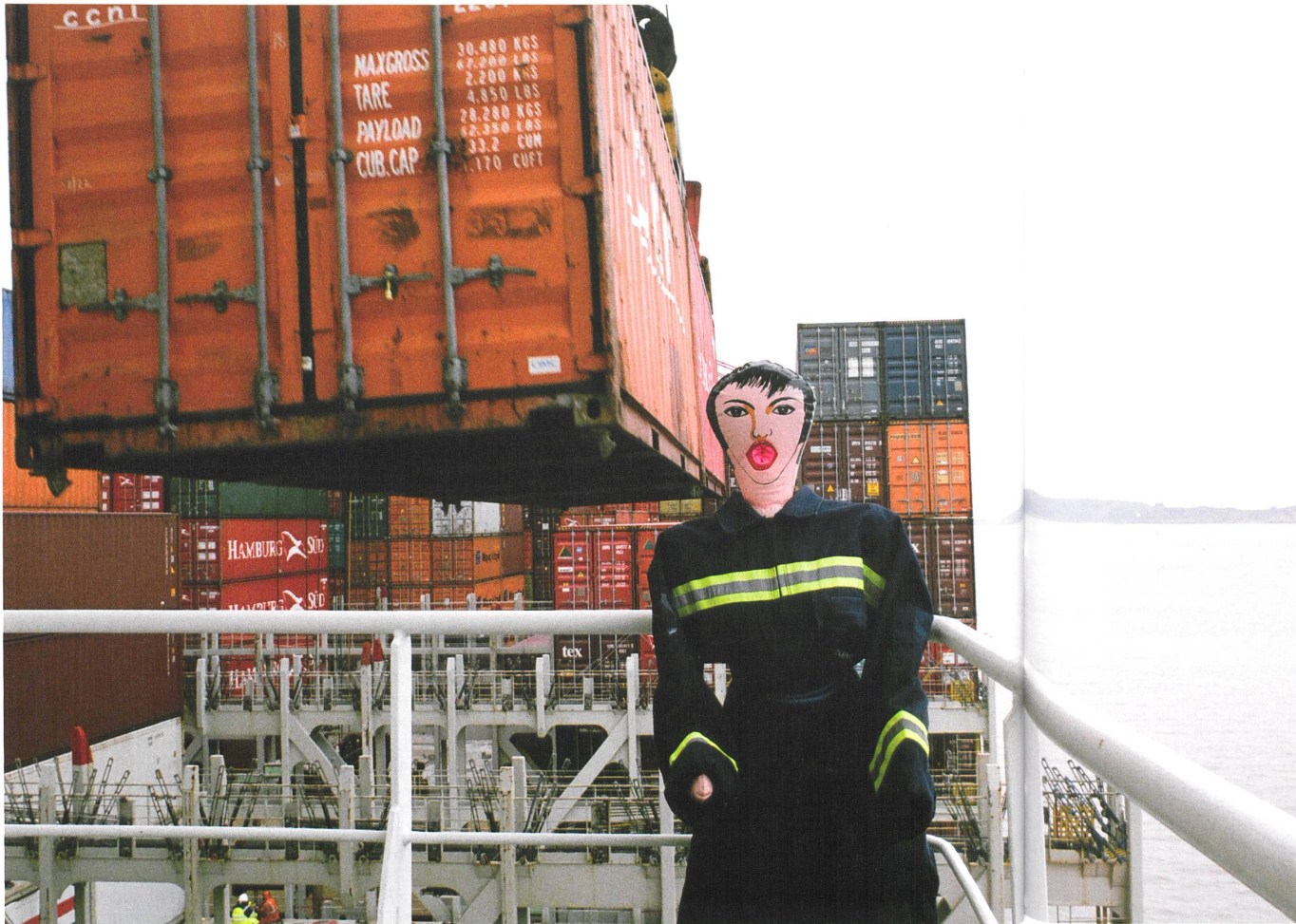
#47 Mejillones, Chile, Dock of Puerto Angamos 21.01.2017