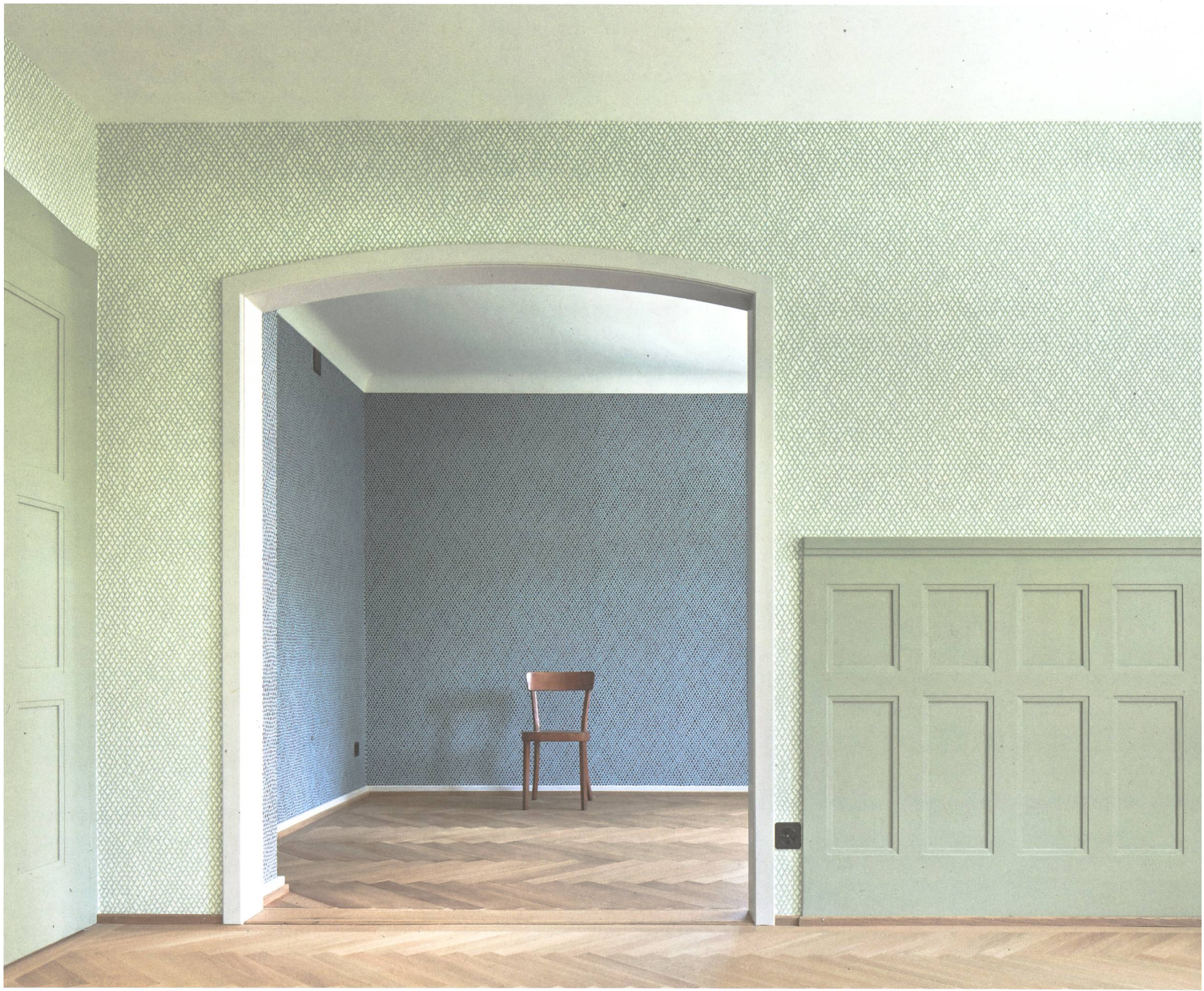
fig. b Haus an der Pestalozzistrasse