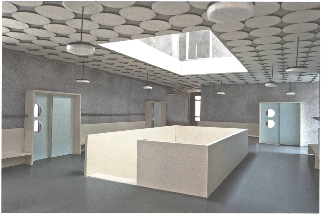
fig. c Model for the School Aemler