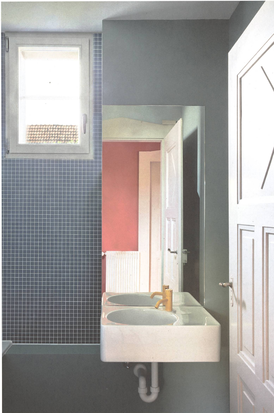
fig. f Haus an der Pestalozzistrasse