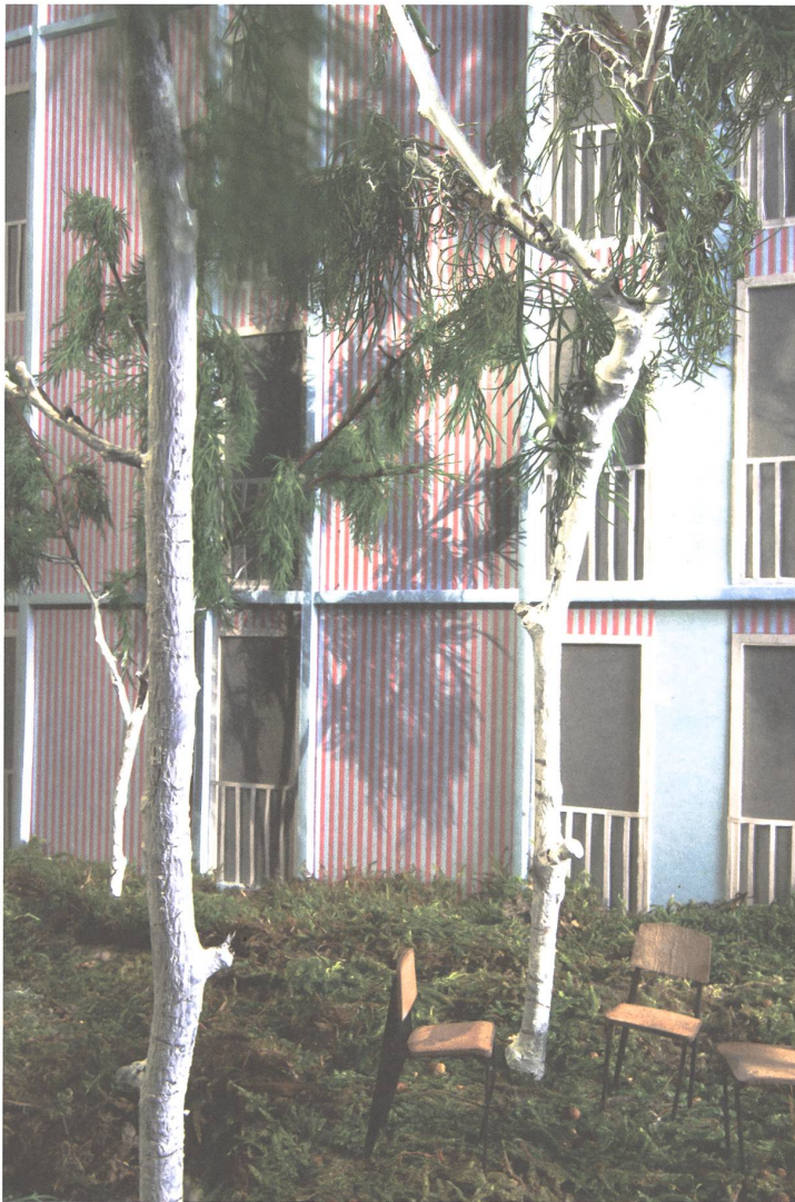
fig. d Proposal for the competition Baugenossenschaft Waidmatt