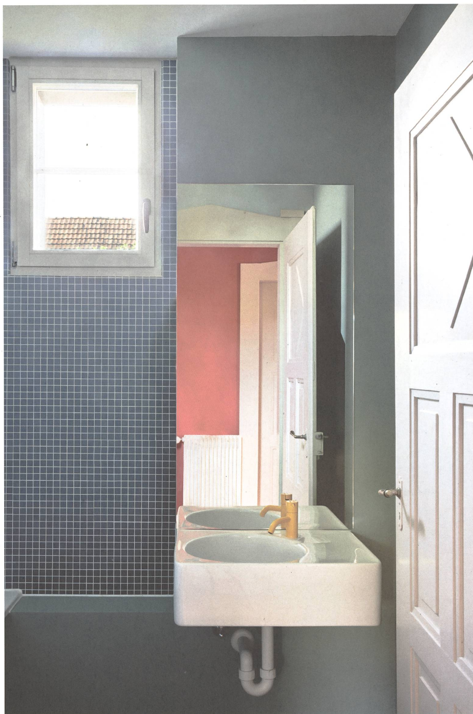
fig. f Haus an der Pestalozzistrasse