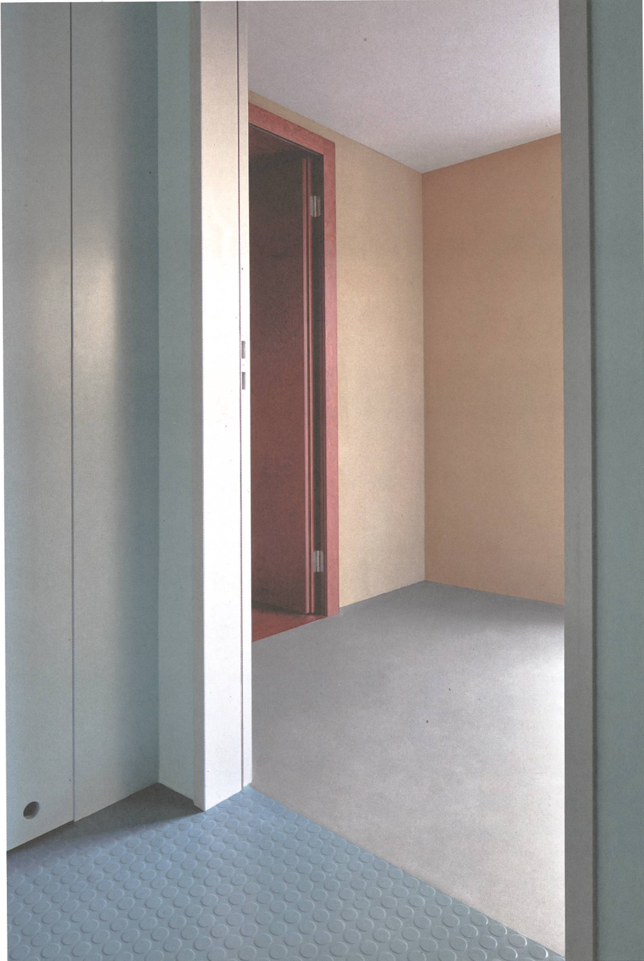
fig. e Haus des Kupferschmieds