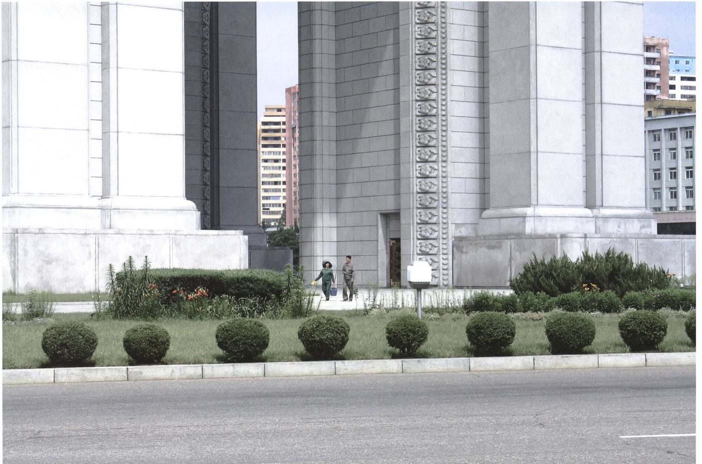
fig. f Arc of Triumph, 2016