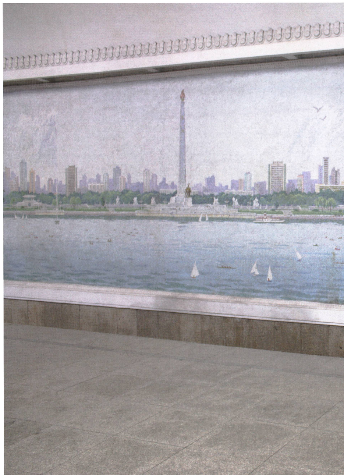
fig. e Pyongyang underground: Yonggwang station, 2016