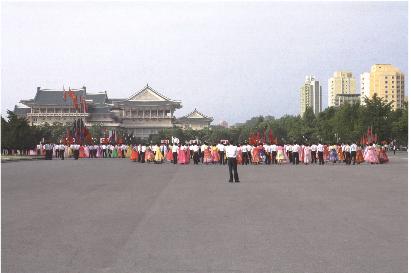
fig. c Mass dance in in front of the People's Palace of Culture, photographed by the author, 2016