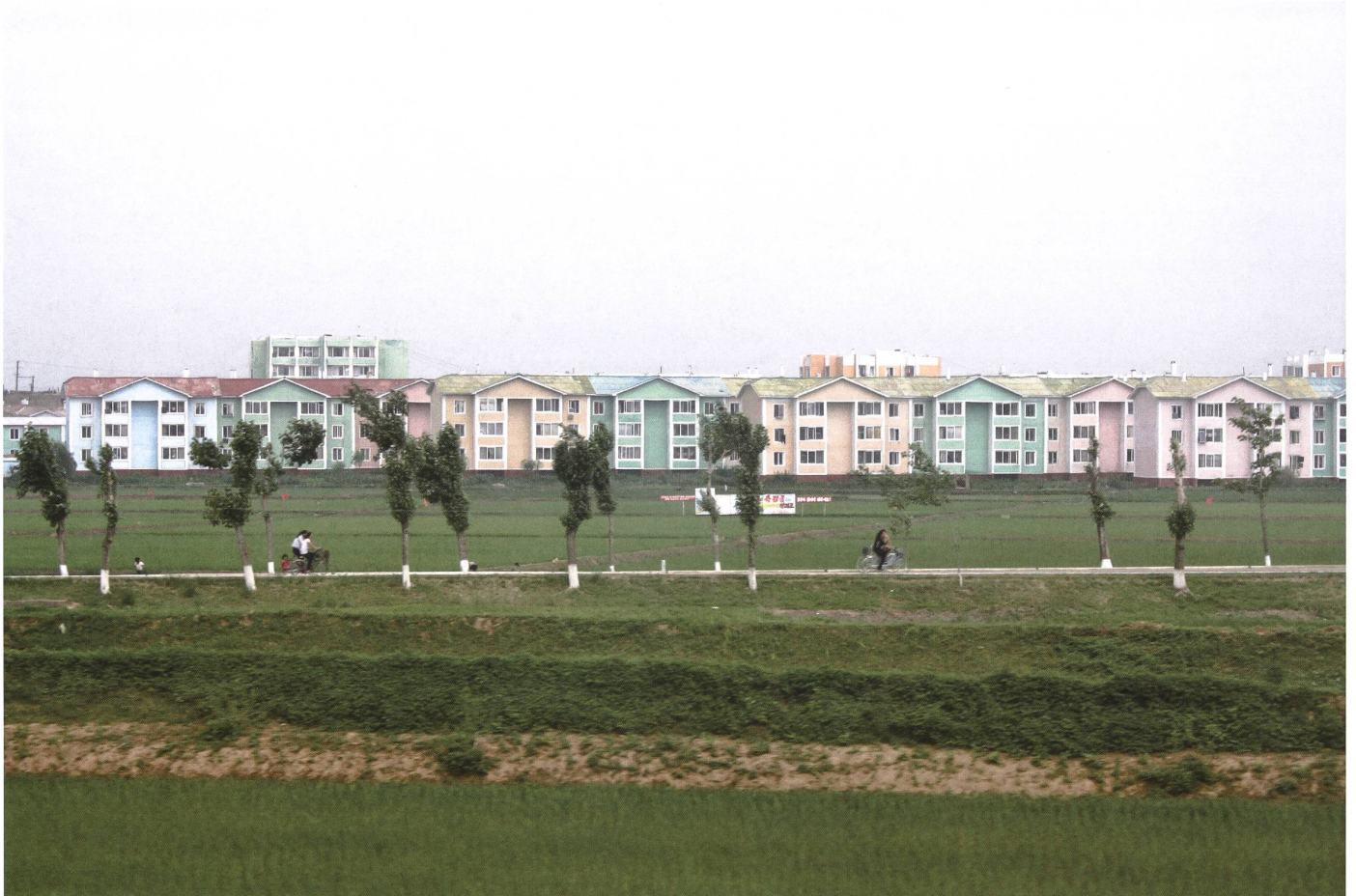
fig. i Residential buildings in the periphery of Pyongyang, photographed by the author, 2016