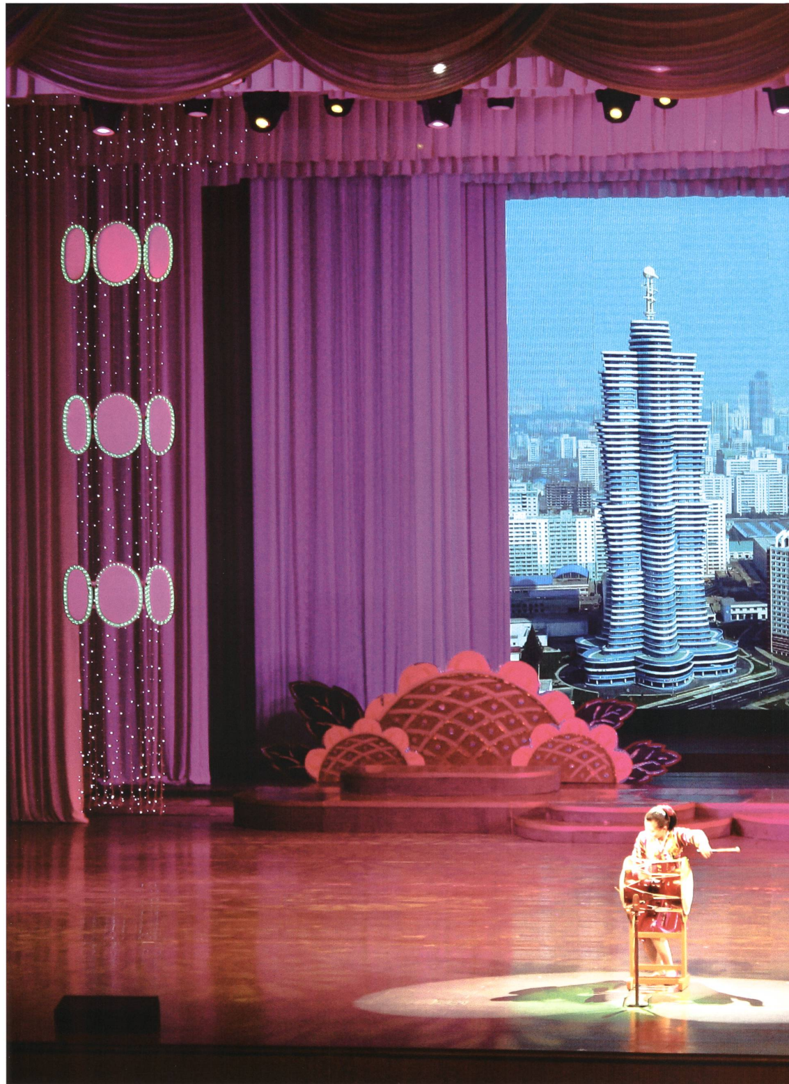
fig. h Children's performance at the Mangyongdae Children's Palace. On the backdrop: Mirae Scientists Street development, photographed by the author, 2016