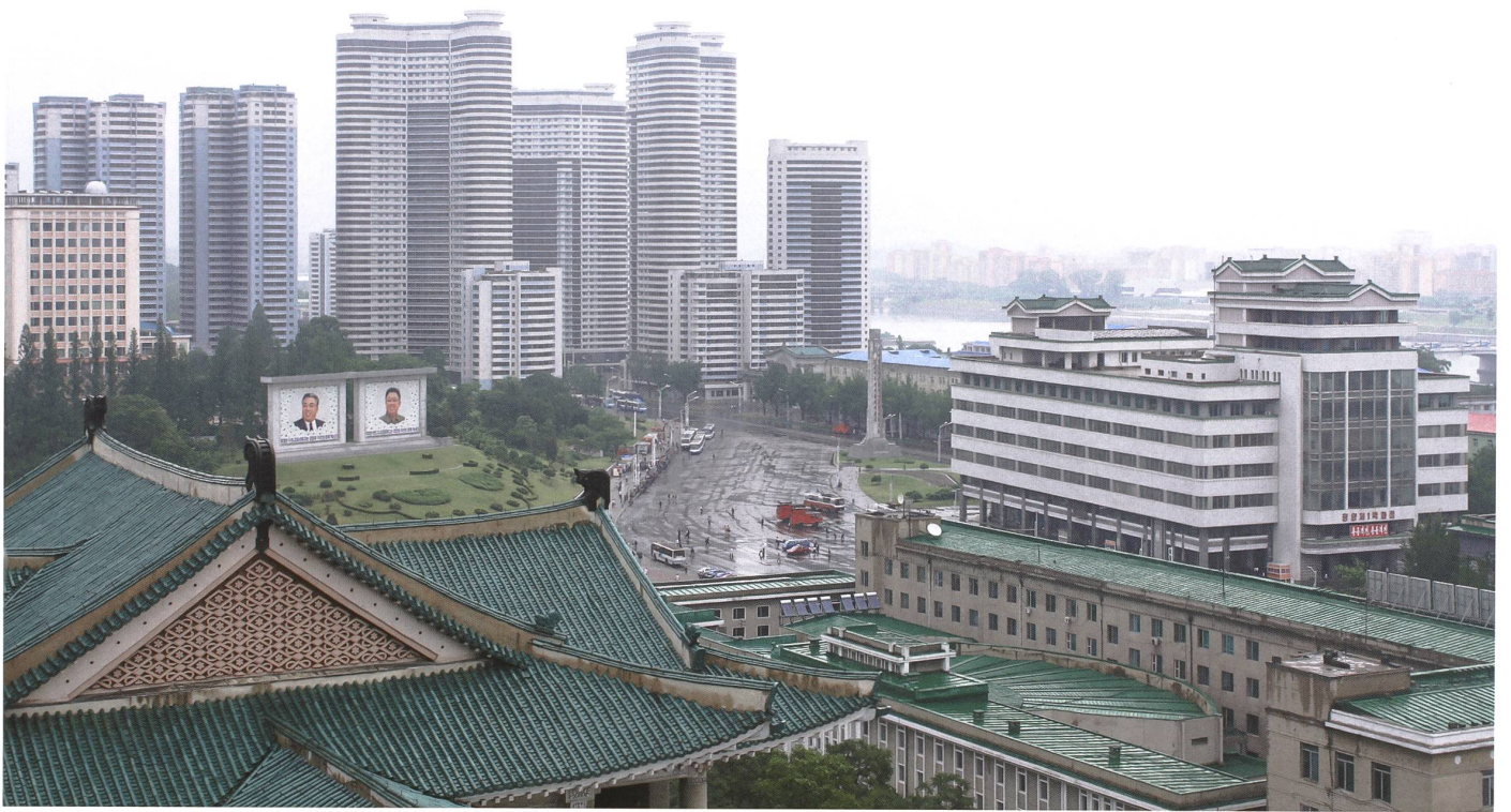
fig. d Changjon Street apartment complex