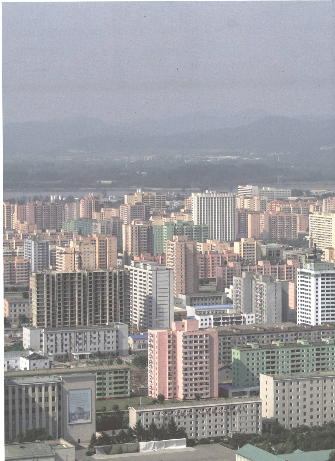
fig. a Tongdaewon district and Party foundation Monument, photographed by the author, 2016