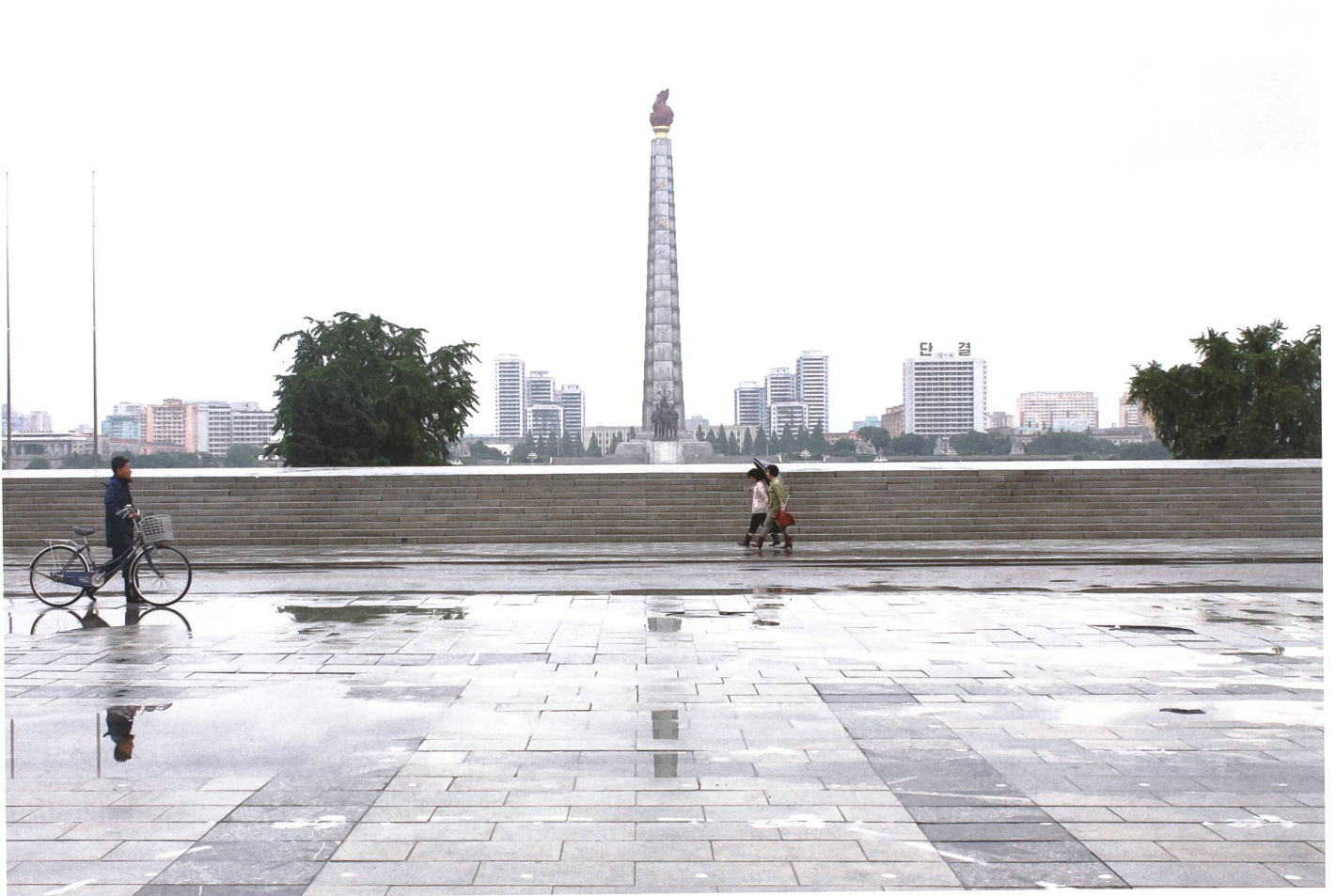
fig. g Kim Il Sung square and the Juche tower, photographed by the author, 2016