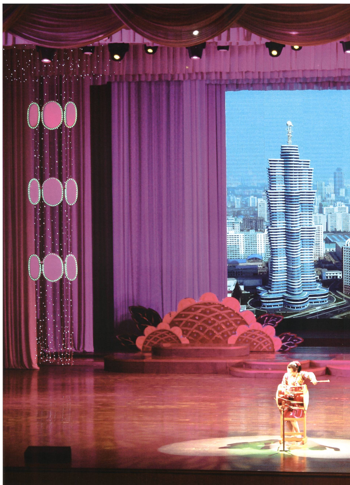
fig. h Children's performance at the Mangyongdae Children's Palace. On the backdrop: Mirae Scientists Street development, photographed by the author, 2016