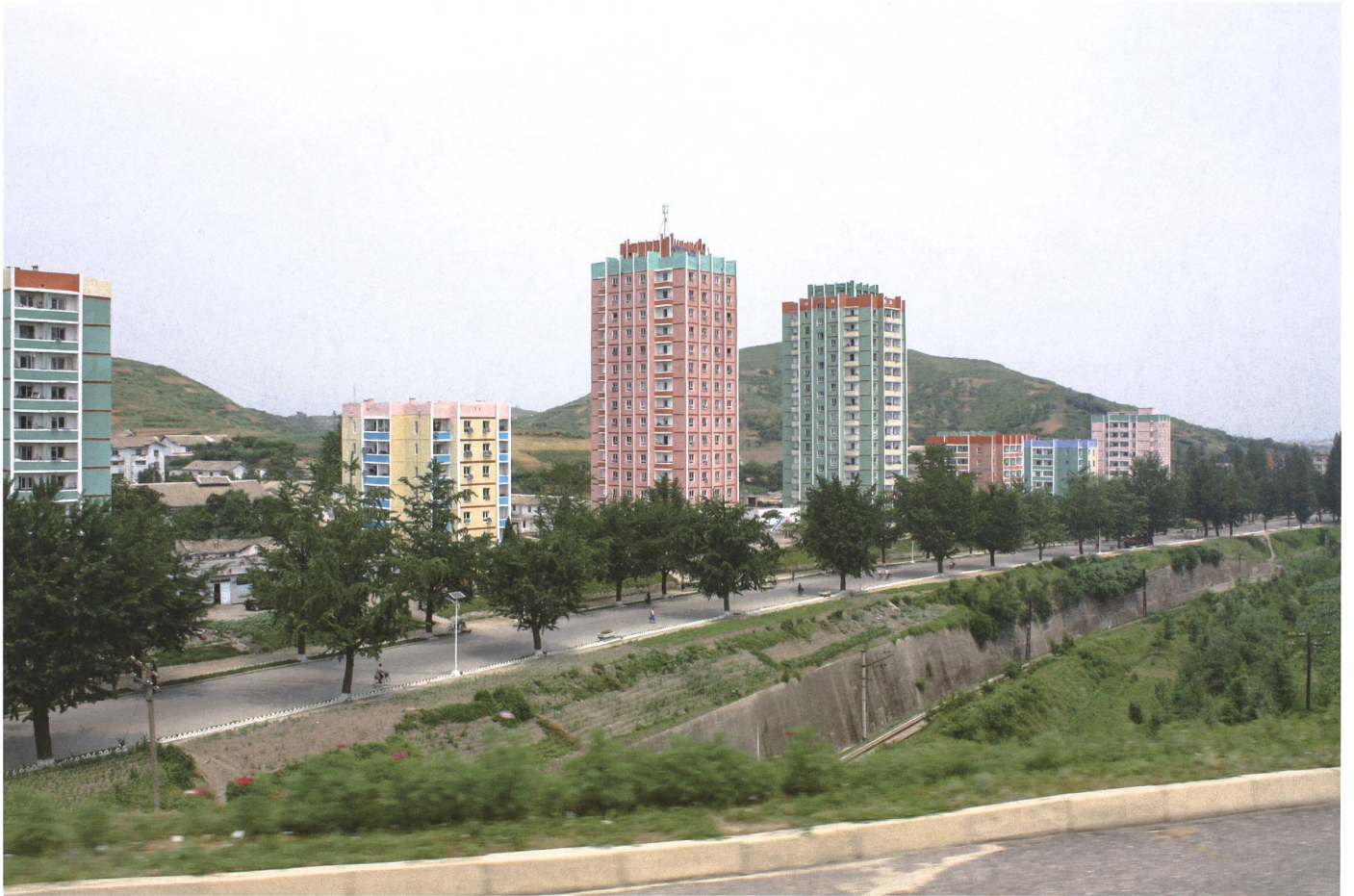
fig. b Residential buildings in the periphery of Pyongyang, photographed by the author, 2016