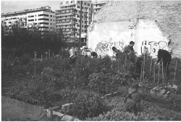
Community Garden in Budapest.

For instance the 'Közösségben Élni / Community Living' – initiative established in 2012 has formulated the aim of cohousing as a tool to create sustainable housing developments in Hungary. The 'Közösségben Élni' tries to realize new cohousing, with the active participation of the tenants, from planning to construction to long-term maintenance.