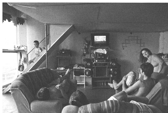
Torre David.

The main motives of bottom-up cohousing initiatives – like 'Karthago', 'Kraftwerk', or 'Dreieck' – are cultural and socio-political dissatisfaction, and, of course, the need for affordable housing and maintenance structures. The initiatives try to create new affordable housing typologies, reacting to the new household-types and living-forms in a changing society. Thanks to the continuous social discussion but also the strong top-down support, these new typologies are now being integrated into the standard housing norms.