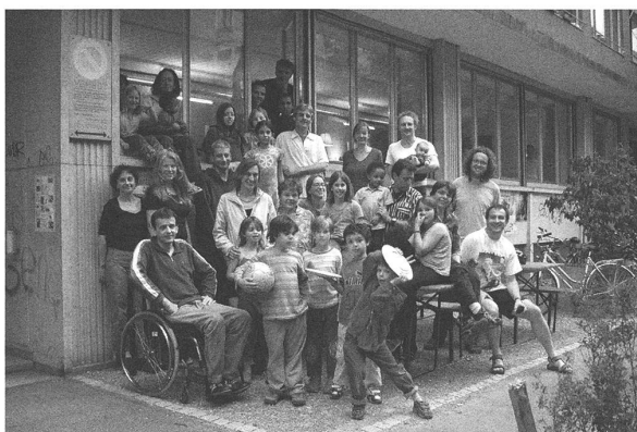
The community of 'Karthago', Zurich.