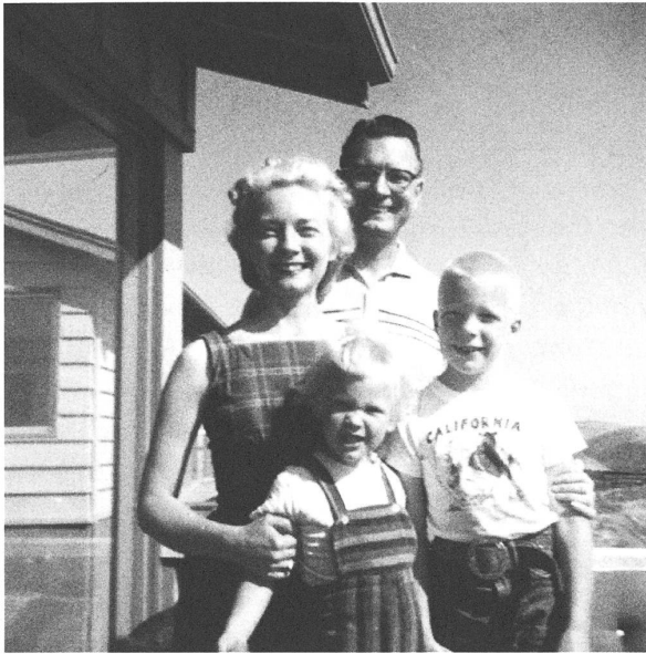
Nuclear family, 1955.