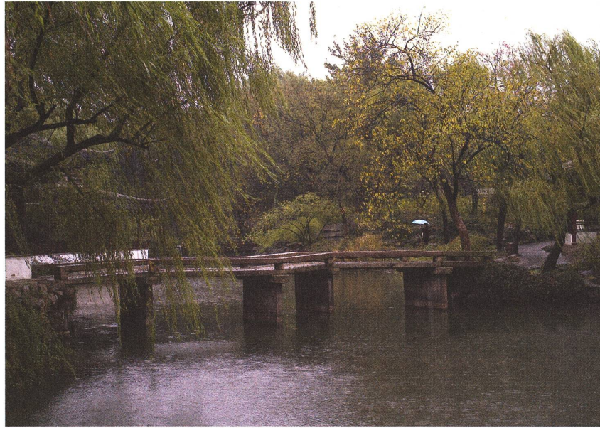
fig. a Figure standing by a rain swept bridge in the wind, Garden of the Humble Administrator in Suzhou.

traditions. Each garden, is considered as a fragment of the whole, and understood also as a figure of virtuous human conduct. It is the moment when garden aesthetics meet Confucian precepts of ethics, virtue and courage imbedded in rock outcroppings and pine trees, obvious symbols of endurance and longevity. 2 Each plant and rock is precisely placed to exude a meta-meaning in the garden. The spatial realm created by the Oriental garden is spherical and atmospheric in figuration and its dynamic comes across to the Western eye as being non-directional. The all-encompassing beauty of this figure unfolds for the visitor only at the heart of the garden. The human subject is thus always imagined as inhabiting the landscape, symbol of