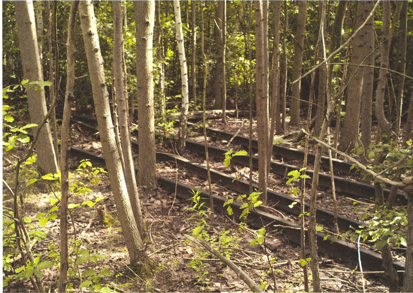
fig. b Ecological rail yard with spontaneous vegetation growing on rubble in the Schöneberg Südgelände, Berlin.

Ecology cannot replace the poetic reception of a figure of landscape that has been finely chiselled into societal values and cultural beliefs since times immemorial. We, therefore, need to reconsider the role of landscape composition actively and at all scales. Ecology could easily become the subject of some larger landscape composition, and there are many arguments both economic and environmental that plead for the rehabilitation of an aesthetic of nature at the heart of our cities. We could also benefit enormously at this point from the balanced merger of the Orien-