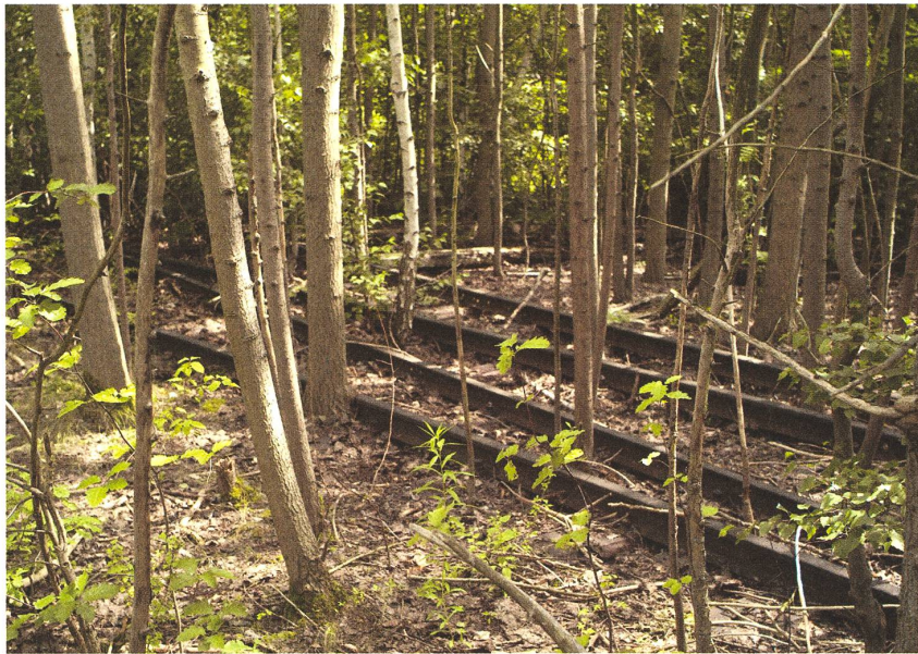
fig. b Ecological rail yard with spontaneous vegetation growing on rubble in the Schöneberg Südgelände , Berlin.

Ecology cannot replace the poetic reception of a figure of landscape that has been finely chiselled into societal values and cultural beliefs since times immemorial. We, therefore, need to reconsider the role of landscape composition actively and at all scales. Ecology could easily become the subject of some larger landscape composition, and there are many arguments both economic and environmental that plead for the rehabilitation of an aesthetic of nature at the heart of our cities. We could also benefit enormously at this point from the balanced merger of the Orient-