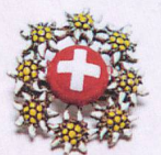
First design for the golden flower