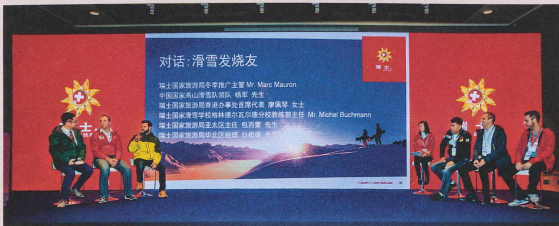
ST presents the Swiss winter at the first World Winter Sports Expo in Beijing.