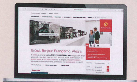
MySwitzerland.com set a new record, with over 30 million visits.

** Number of followers on Facebook, Twitter, YouTube, Pinterest, Instagram, Tumblr, LinkedIn, Vine, Weibo, Ren Ren, Google+, WeChat