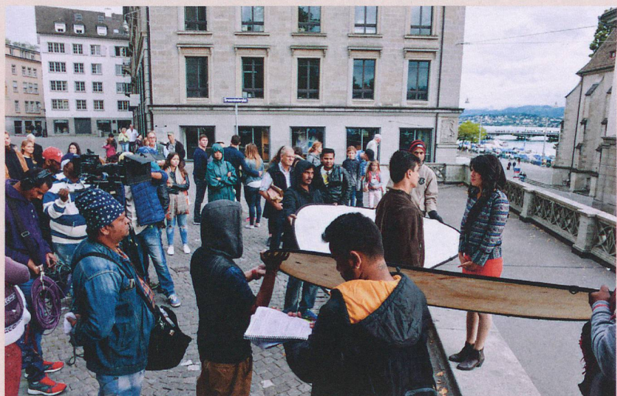
ST assisted the 34-strong Indian film crew and their one ton of equipment on the journey through Switzerland – as here in Zurich.