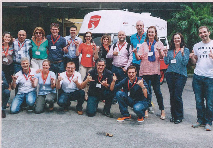
The new concept of the STE Brazil has been very well received by tourism partners.