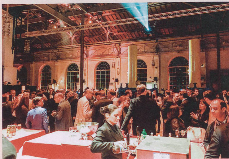
The Bâtiment des Forces Motrices (BFM) in Geneva where a night-time event for the International Moving Industry (FIDI) was held.

Europe is decreasing. In order to compensate for this decline, the Switzerland Convention and Incentive Bureau (SCIB) has continued to promote diversification with regard to the variety of markets and types of meetings. For example, there is great potential in incentives, particularly in Asia, and in congresses for associations. These tend to be less price-sensitive and Switzerland profits from its good image. In 2016 the SCIB was able to help many congresses come to Switzerland, the Association for Physiotherapy with 5,000 participants, and the conference of the International Moving Industry (FIDI) with 600 participants, among others. Together with other meetings and incentive trips, 2016 saw 1,479 offers processed and 797 meetings held in Switzerland.