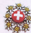
First design for the golden flower