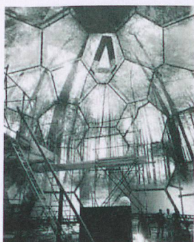
At the National Exhibition in Lausanne the SNT0 presented a polyvision panorama show in special wide-screen format, in a spectacular pavilion.

Preserving nature is a core interest of Switzerland Tourism – and a decisive, strategic factor in the success of the organisation. The new slogan since 2003 "Switzerland. get natural." went straight to the heart of the matter: witness the 18 new natural parks and the 2009 sustainability charter drawn up with industry partners. So it follows that the motto for the anniversary year 2017 harks back to the roots of tourism here: "Nature wants you back" – the fundamental reason for (re)discovering Switzerland.