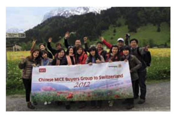
Participants on the study trip from China on their excursion up the Titlis.

In 2012, ST's SCIB department extended its market presence in the cities of Beijing, Shanghai, Hong Kong and Guangzhou. An important element was educational training for incentive agencies and other important decision makers. To this end, SCIB coordinated a study trip for 12 incentive-travel organisers to Zürich, Lucerne and the Titlis – which has already led to follow-up business.