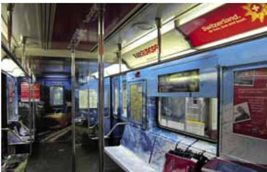
A full Switzerland makeover: a carriage of the 42nd Street Shuttle of the New York City Subway.

The New York City Subway’s 42nd Street Shuttle links Grand Central Station and Times Square, carrying about four million passengers a day. For a full month in spring, travellers found themselves in a little corner of Switzerland: the carriages were decorated inside and out with Swiss images. The campaign was accompanied throughout by promotions, events and competitions.