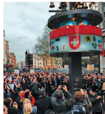
Inauguration of the new Swiss glockenspiel in London's Leicester Square.