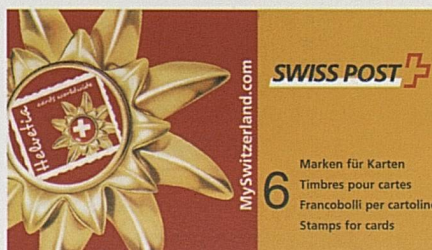
Exclusive stamps from the Swiss post office.