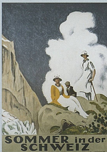
Emile Cardinaux. Summer in Switzerland, 1921