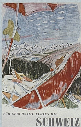
Alois Carigiet. For relaxing holidays. Switzerland, 1953