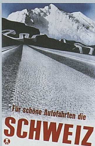
Herbert Matter. For beautiful car journeys choose Switzerland, 1935

If we look back over almost 85 years of promoting Swiss tourism, we see both change and consistency. At the beginning stand our legendary mountains, as depicted by the 1921 «Summer in Switzerland» poster designed by the artist Emile Cardinaux. The mountains