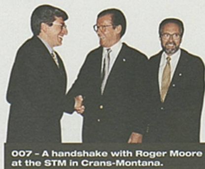
007 - A handshake with Roger Moore at the STM in Crans-Montana.

On the basis of the STM, travel experts predict an overall increase of 300,000 overnights in Switzerland and of 12,000 passengers for Swissair over the seasons winter 97/98, summer 98 and winter 98/99.