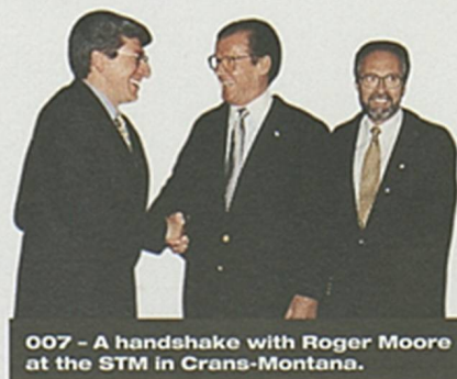
007 – A handshake with Roger Moore at the STM in Crans-Montana.

On the basis of the STM, travel experts predict an overall increase of 300,000 overnights in Switzerland and of 12,000 passengers for Swissair over the seasons winter 97/98, summer 98 and winter 98/99.