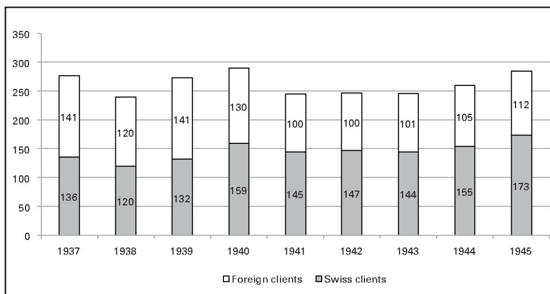
Figure 2. Third-party assets of leading private banks (in millions CHF). Source: Marc Perrenoud, Rodrigo López, Aspects des relations financières franco-suisse (1936–1946) , Zurich 2002, p. 53.

tended elsewhere in France. In 1840, Basel had only 24,000 inhabitants but as many as sixteen bankers, whose capital went to finance the development of the textile industry in Alsace and Baden. The expansive financial climate following the Franco-Prussian War was also proof of the close ties linking Swiss and German finances. At that time, a group of private bankers in Basel, in conjunction with the Frankfurter Bankverein, the Berliner Bankverein and the Wiener Bankverein, agreed to found the Basler Bankverein, an ancestor of the Schweizerischer Bankverein, in 1871. 25