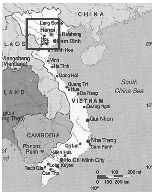
Map 1: Vietnam showing the research area.

In order to reveal the diversity, use and economic value of NTFPs an income survey of eight households with a high dependency on NTFPs was conducted in each of the two villages in March and April 2004. The identified NTFPs were classified into bamboo, medicinal plants, ornamental orchids, mushrooms, extracts and other NTFPs (see table 1). From the identified NTFPs key informants selected the ten most important