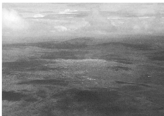
Figure 2: Figure 2a shows the village of Kasulo before the arrival of the refugees. Figure 2b shows the main camp of Benaco six months after the arrival of the refugees. Kasulo is completely merged with the camp.

Abbildung 2: Abbildung 2a zeigt das Dorf Kasulo vor der Ankunft der Flüchtlinge. Abbildung 2b zeigt das Hauptlager von Benaco sechs Monate nach der Ankunft der Flüchtlinge. Kasulo ist komplett verschmolzen mit dem Lager.