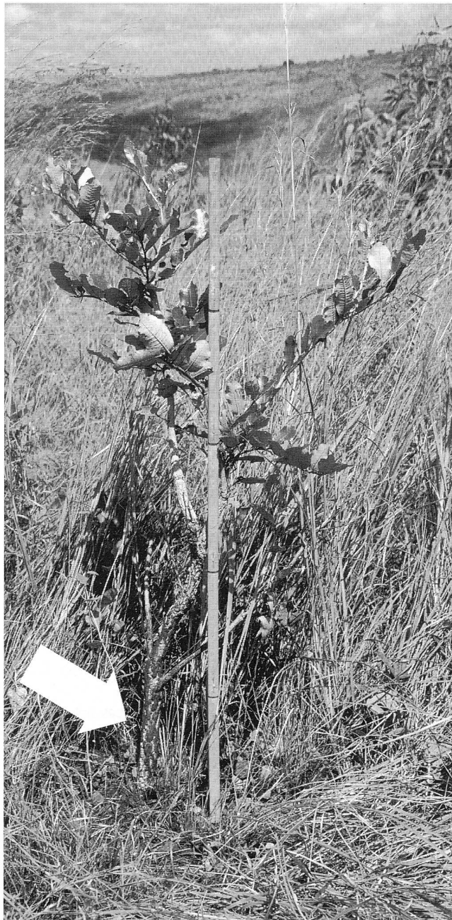
Figure 3: The burning has only scorched the bark of this young Parinari curatellifolia without harming the plant (photograph taken one year after the burning); height of the stick: 1 m.

The fire management plan was applied to an area of about 25 km 2 . Controlled early-burning for the protection of the natural woody regeneration comprised an area of about 5 to 10 km 2 . Furthermore, about 40 km of firebreaks were created by controlled burning. No undesired fire occurred in the core area of the deforestation. This positive result could not have been achieved without the support of the well-trained fire brigade and the local community. Additional motivation was given to the fire brigade in the form of a promise of financial reward at the end of the dry season if no undesired fire had occurred.