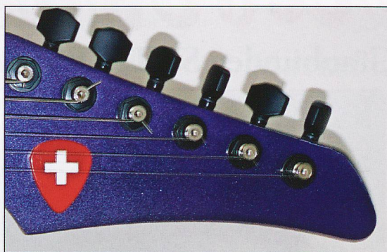
LEFT: Contents of the bag. ABOVE: Guitar logo.

During our recent stay at Göschenen, my daughter and I decided to go to Interlaken. After lunch we went to our favourite Brocki at the Park Hotel, Goldswil and bought a few items for 6 ChFs. Catching the 15:04 return service, we stopped at Brunig Hasliberg to visit the Brocki on the station.