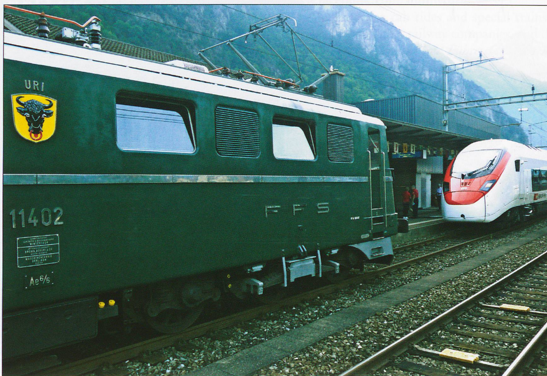
The old 'Uri' and the new 'Uri'.