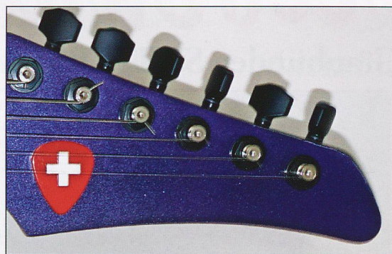
LEFT: Contents of the bag. ABOVE: Guitar logo.

During our recent stay at Göschenen, my daughter and I decided to go to Interlaken. After lunch we went to our favourite Brocki at the Park Hotel, Goldswil and bought a few items for 6 ChFs. Catching the 15:04 return service, we stopped at Brunig Hasliberg to visit the Brocki on the station.