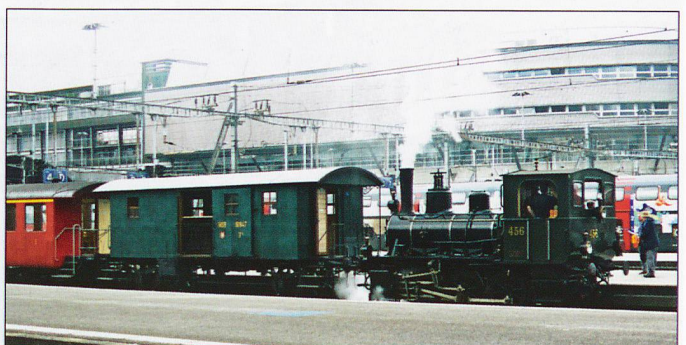
NOB/HSTB E 3/3 456 at Luzern.