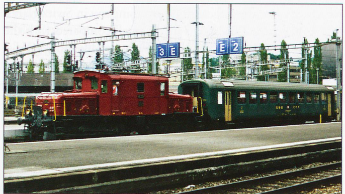
Welcome to Luzern: ‘Seetal-Kroki’ De 6/6 No. 15301.