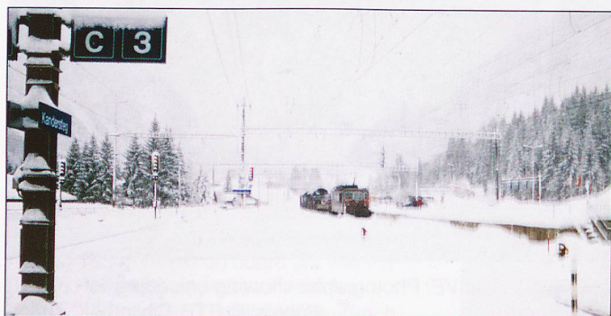
BLS car train in deep snow at Kandersteg.