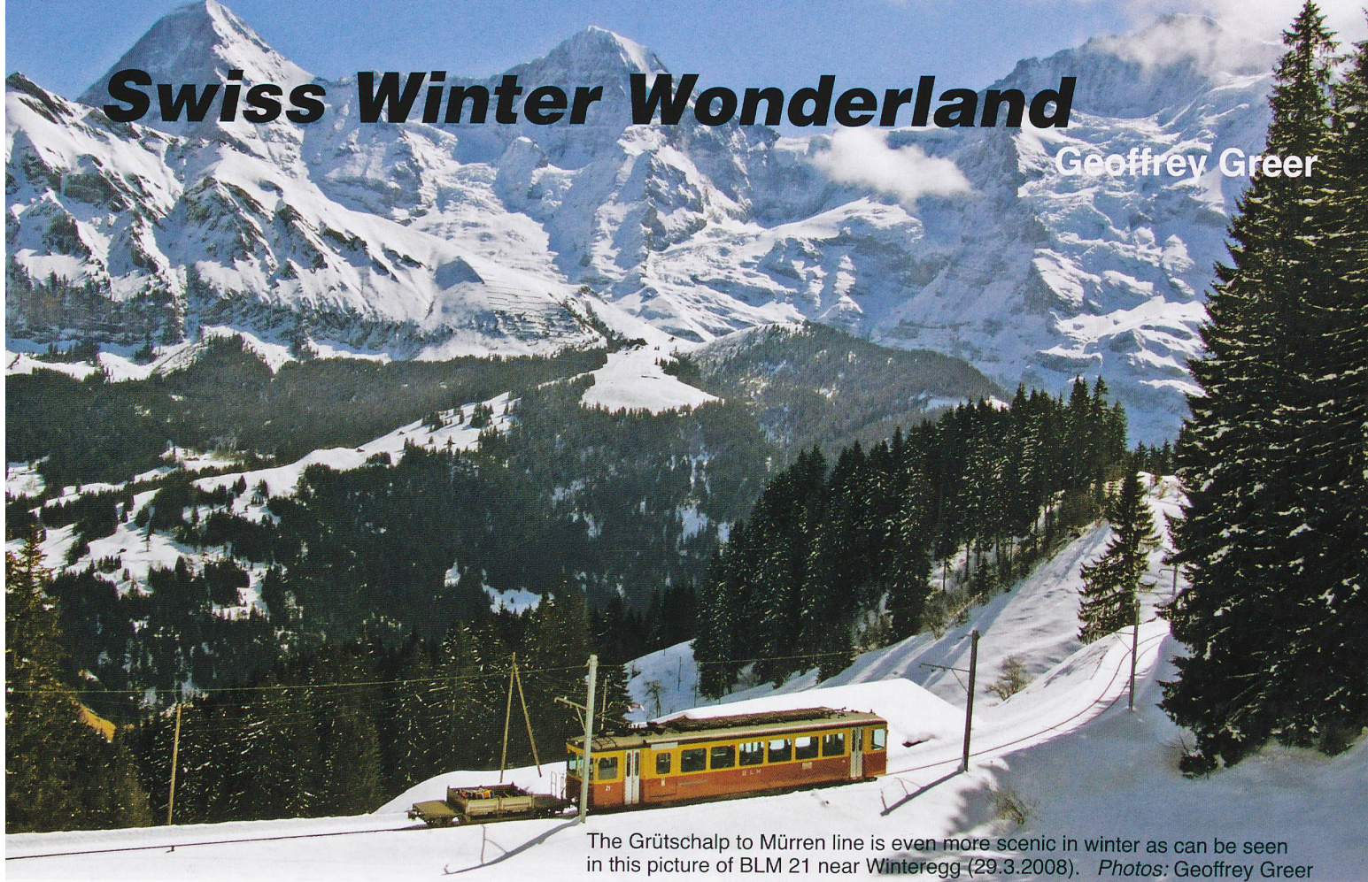
The Grütschalp to Mürren line is even more scenic in winter as can be seen in this picture of BLM 21 near Winteregg (29.3.2008).