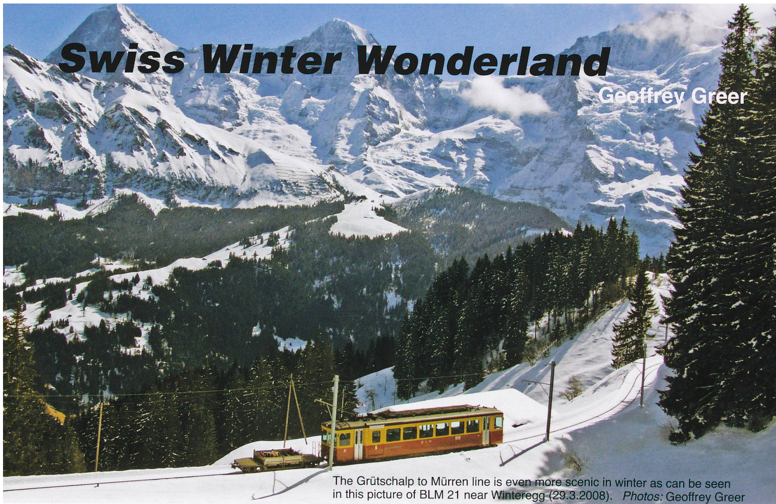
The Grütschalp to Mürren line is even more scenic in winter as can be seen in this picture of BLM 21 near Winteregg (29.3.2008).