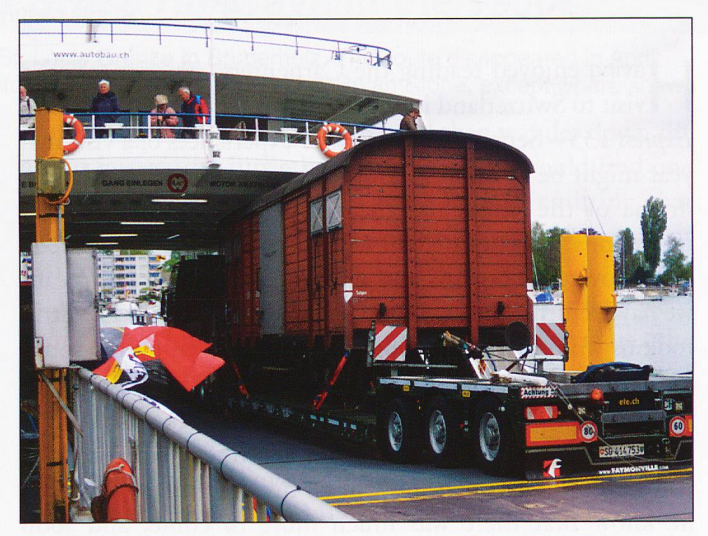
Closer view of this contraption.