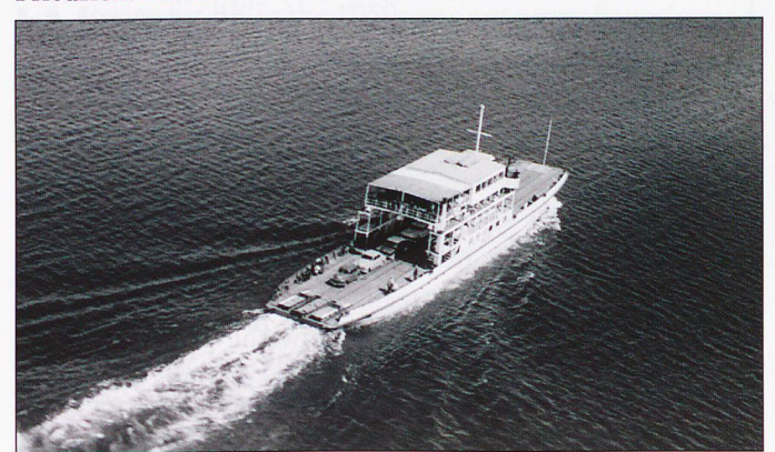
he MF Schussen seen from the air on Tuesday, 31st July 1956. Unusually it is in use as a car ferry. Normally it would carry railway freight on a weekday and car traffic at weekends.

In 1958 the ferry Romanshorn went into service on the lake. She was joined in 1966 by the Rorschach. Train ferry traffic however only survived until 30th May 1976, a victim of falling frequencies and rising costs. Both the Romanshorn and the Rorschach were rebuilt as pure car ferries and can still be seen today, the Rorschach having been renamed the Friedrichshafen.