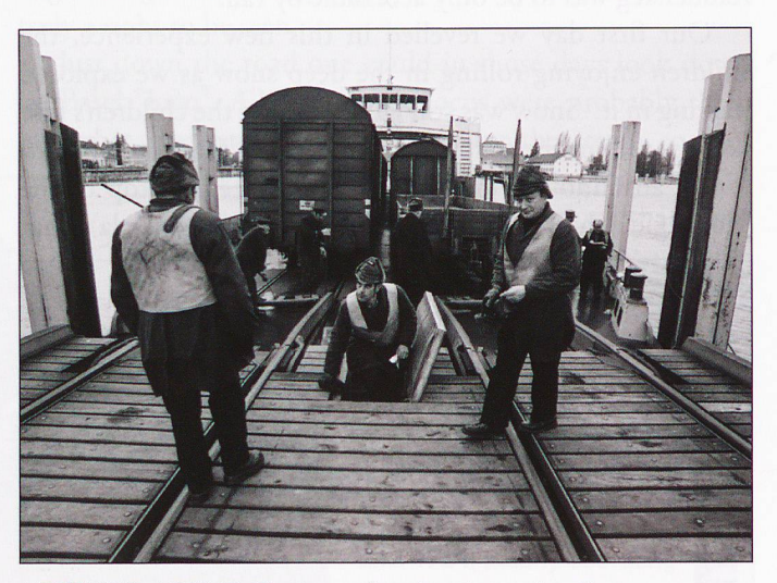
LEFT AND ABOVE: Photographs showing unloading procedures.