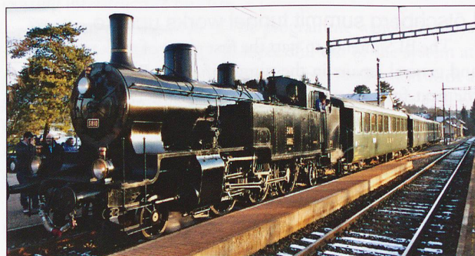
The special at Gerafingen during a water stop.

5810 is normally housed at the depot of the Verein Dampfbahn Bern at Konolfingen. Currently however Konolfingen is under repair and 5810 is shedded temporarily at Huttwil.