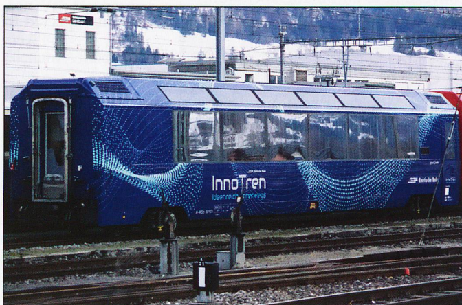
The Innotren carriage at Landquart.

A number of itineraries are offered. For example, for an introductory offer of CHF 765 you can attach the carriage to the 0947 Landquart to Davos Platz.