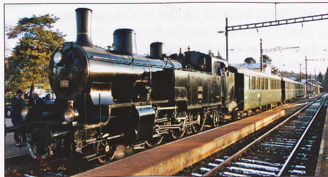
The special at Gerafingen during a water stop.

5810 is normally housed at the depot of the Verein Dampfbahn Bern at Konolfingen. Currently however Konolfingen is under repair and 5810 is shedded temporarily at Huttwil. (H J Schweizer)