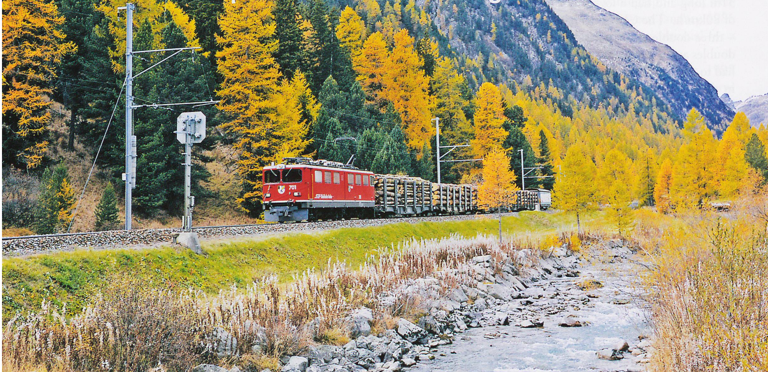
The Beverin River and a Chur GB to Samedan freight.