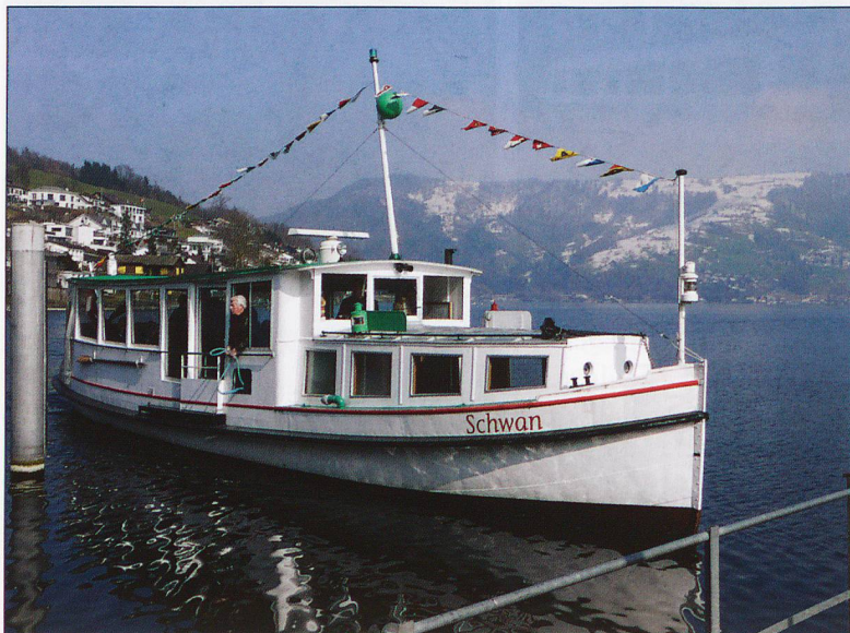
TOP: “Orion” bus no 5. MIDDLE: The “Elephant” of Zug. LEFT: MS “Schwan II”.