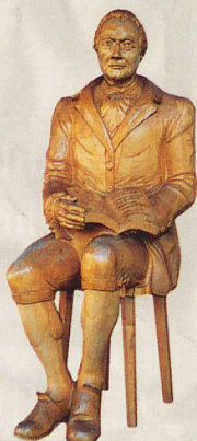
Johann Wolfgang von Goethe