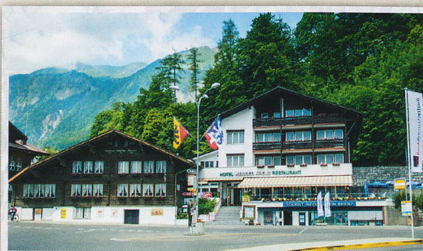
Hotel Weisses Kreuz