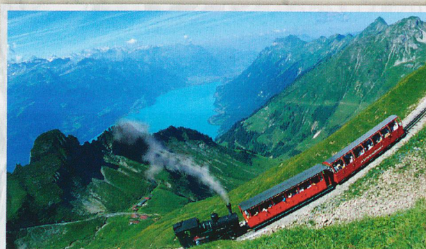
Brienz Rothorn Steam Railway