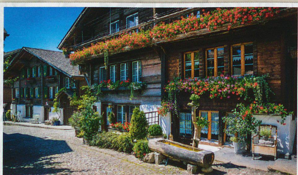
Brunngasse, historic part of Brienz – typically swiss