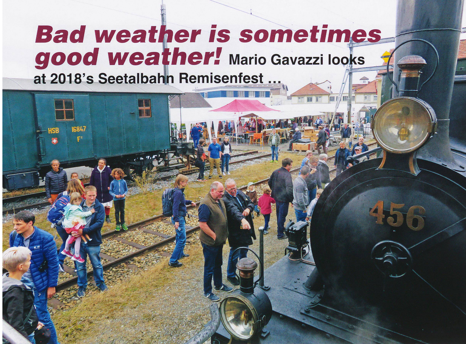
Lots of guests on the area of the Remise at Hochdorf.