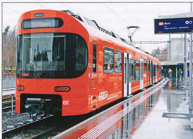
'Worbla' 02 is seen on a wet 21 st December, its first day in service at Bolligen.

On the 21st December RBS introduced the first of its new 'Worbla' four-car articulated EMUs. By the end of 2019 14 of these trains will be in service. They will replace the aging 'Mandarinli' units currently used on S7 Bern to Worb Dorf services.