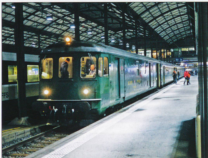
RBe4/4 No.1405 at Luzern Hbf.

historic rolling stock. On 20th October 2018, they operated a day tour from Koblenz to the Valais using their green Pendelzug composition (RBe 4/4 1405, DZt 911, EW I A and EW I B). The tour repeated an itinerary successfully followed in 2017. After leaving Koblenz in the early hours the tour travelled via Zürich, Olten and Bern, then over the Lötschberg mountain route to Brig where it reversed to continue to Martigny. Shortly afterward the Sion-Sierre stretch was due to be equipped with ETCS Level 2 which will make future operations by heritage stock on the main line through the Wallis/Valais problematic. On arrival at Martigny the tour visited the TMR branches to Orsières and Le Châble before retracing its steps to Thun. From Thun the preserved composition took the Emmental line to Luzern, where our correspondent Mario Gavazzi (who says he always carries his camera with him!) photographed it at approximately 20.00 hours. Mario says the sight made him nostalgic for the time when most of the regional trains in the Luzern area were operated by trains like the DSF heritage stock. After reversals at Luzern and Zürich the train finally returned to Koblenz very late in the evening. (MG)