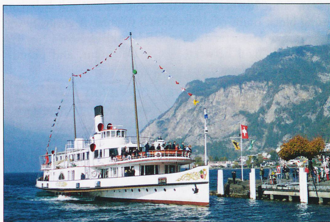
Sunshine welcomes ‘Stadt Luzern’ on its final visit to Flüelen for more than two years.