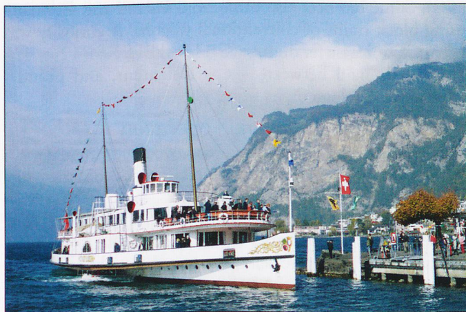
Sunshine welcomes 'Stadt Luzern' on its final visit to Flüelen for more than two years.