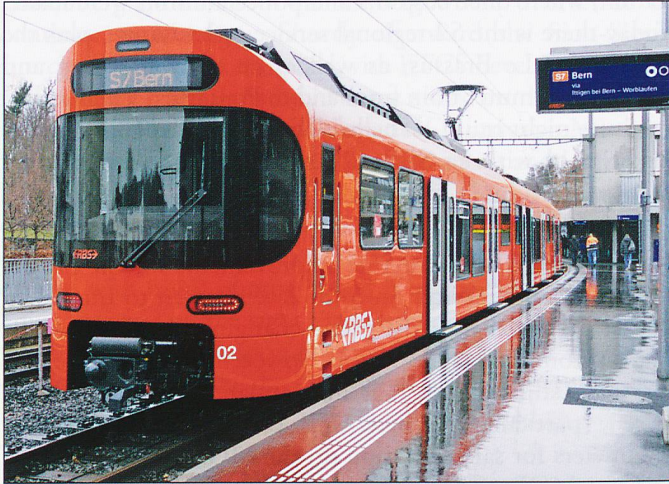
'Worbla' 02 is seen on a wet 21 st December, its first day in service at Bolligen.

On the 21st December RBS introduced the first of its new 'Worbla' four-car articulated EMUs. By the end of 2019 14 of these trains will be in service. They will replace the aging 'Mandarinli' units currently used on S7 Bern to Worb Dorf services.