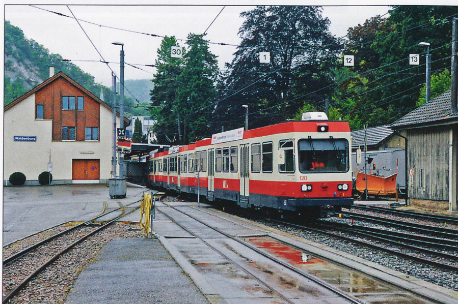
On a wet day in May 2015, WB driving trailer Bt 120 leads a departure from Waldenburg terminus.

The 'unique' WB gauge meant that any programme of rolling stock renewal suitable for the requirements of the 21st C would carry a sizeable initial cost and ongoing maintenance premium, so the opportunity to both modernise and re-gauge the line was clearly the viable option to budget for. As a result, in late 2015, plans were formally approved whereby the 13.1km Waldenburgerbahn would be modernised and converted from 750mm to metre-gauge by 2022. The project would also enable the use of 2650 mm wide stock, compared to the