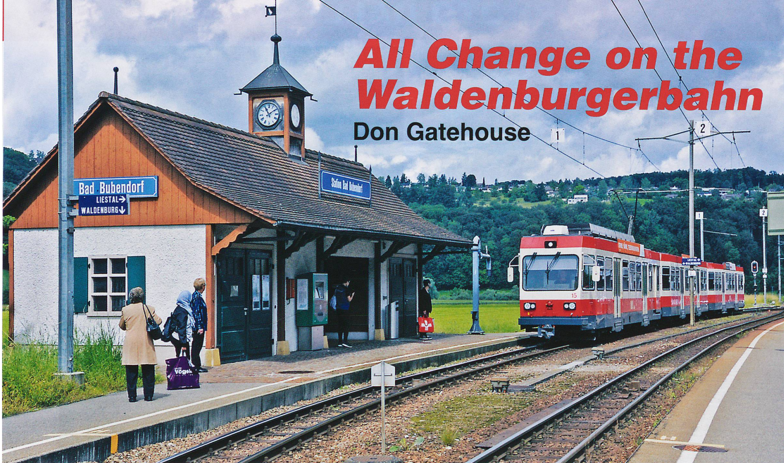
A Waldenburgerbahn services arriving at Bad Bubendorf.