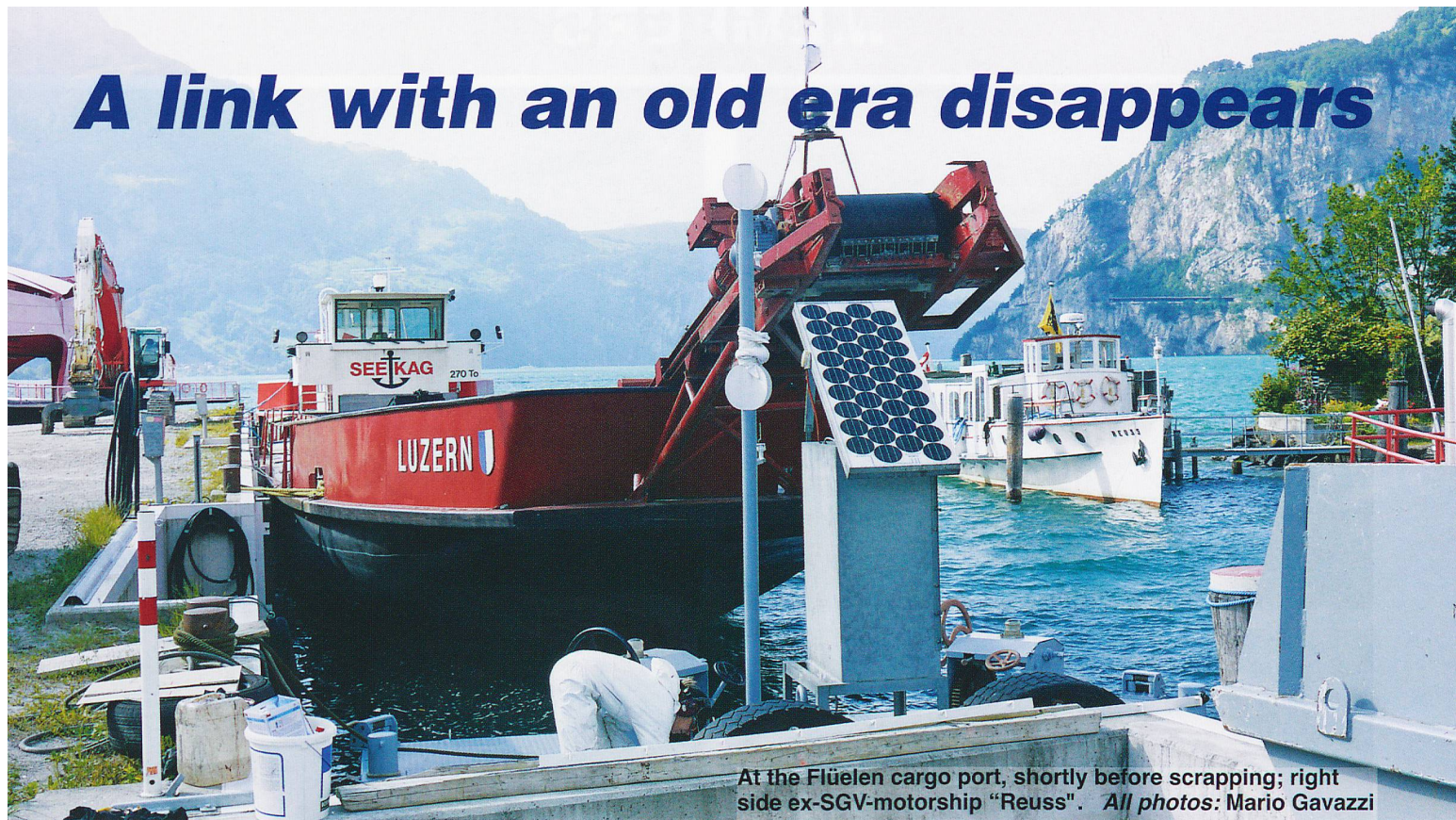
At the Flüelen cargo port, shortly before scrapping; right side ex-SGV-motorship "Reuss".