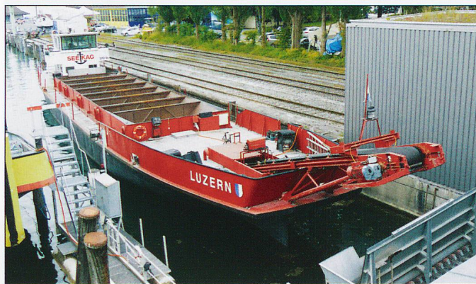
ABOVE: Shortly before the last trip to Flüelen for scrapping. BELOW: The last days at Flüelen, June 28, 2018.