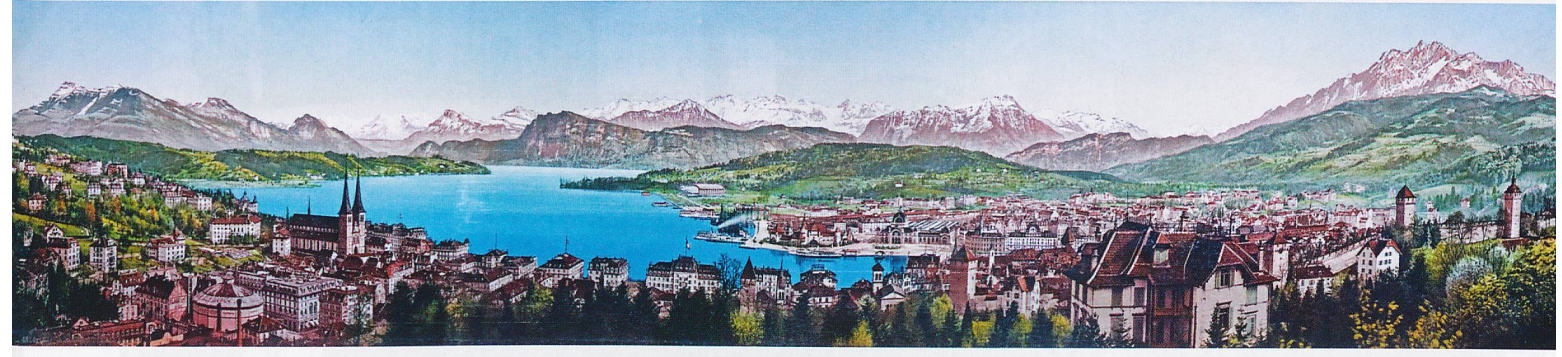
The whole panorama - 88cm x 17 cm.

y daughter recently bought a large panoramic picture of Luzern from a charity shop. In a heavy black and gold frame it looked quite old and was a bit scruffy, the rear being covered with aged brown paper that had seen better days and there was dirt inside the glass. So I carefully took it apart by removing the rusty nails that held the glass, image and backing in place. But how old was it? Initial examination showed the Bourbaki Panorama building was there so that put it after 1890 and the railway station was the 1896 version before the fire of 1971, but that was a large date range. However, closer examination revealed a building on the lakeside at Tribschenmoos, further round from what is now the Kultur-und-Kongresszentrum to the south east of the current station. That building looked remarkably like an airship hanger with an airship poking out.