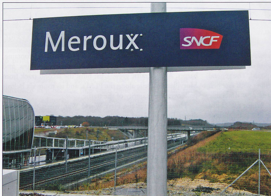
Belfort - Montbéliard TGV high-speed station seen from the new TER platform, which is called Meroux.

is switchable also to 15 kV. Heading towards Switzerland from Belfort Ville, the line diverges from the Belfort-Mulhouse main line a couple kilometres southeast of the city followed by the first stop at Danjoutin. The landscape along the line is mostly agricultural with small villages here and there, but it is generally rather flat – at least by Swiss standards. The next station is known by many names, as it is here that there is a connection with the high-speed services of the LGV Rhine-Rhône. The high-speed line platforms on ground level are known as Belfort - Montbéliard TGV recognising the two larger cities the station serves. This is a typical modern out-of-town TGV station with a large car park and cafes. However, the new platforms for the local TER services to Belfort Ville and Delle, situated on a bridge cross-