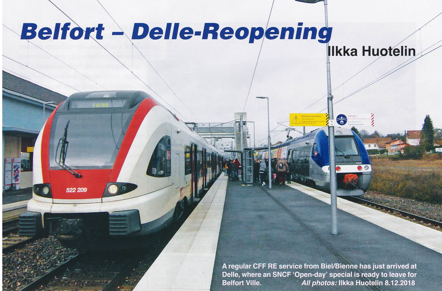
A regular CFF RE service from Biel/Bienne has just arrived at Delle, where an SNCF 'Open-day' special is ready to leave for Belfort Ville.

On the 6th of December 2018 the railway line between Belfort and Delle in the French region of Bourgogne-Franche-Comté was officially re-opened. The general public were invited to celebrate the re-opening with an open day on the 8th, and the next day with the new timetable period, regular passenger services re-started. Whilst the 22 km line is situated entirely within France, the line is important also for Switzerland and its reconstruction was partly financed by the Canton of Jura and the Confederation, as it re-connects the Swiss rail network at Delle to the French one and improves access to the Swiss Jura region.