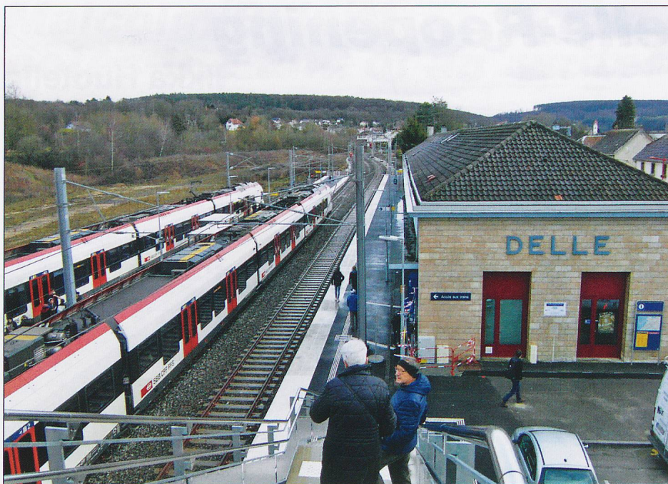
Delle station, with CFF Flirt France units meeting, viewed from the pedestrian bridge crossing the tracks. The station is just a few hundred metres from the Swiss border and the buildings seen in the background are already in Switzerland.