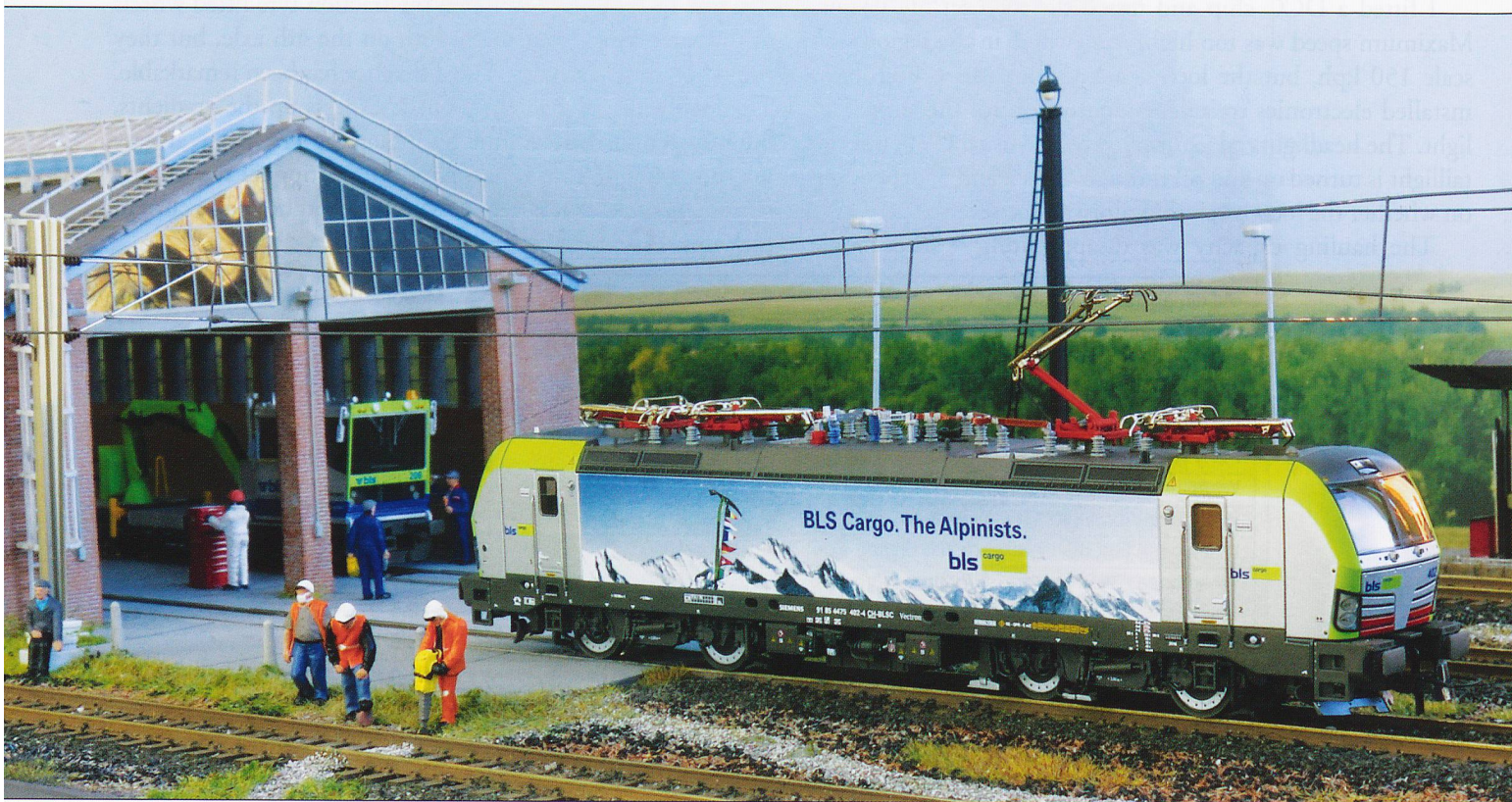
The completed diorama. Roco BLS Vectron and Kibri Tm 235 on shed.