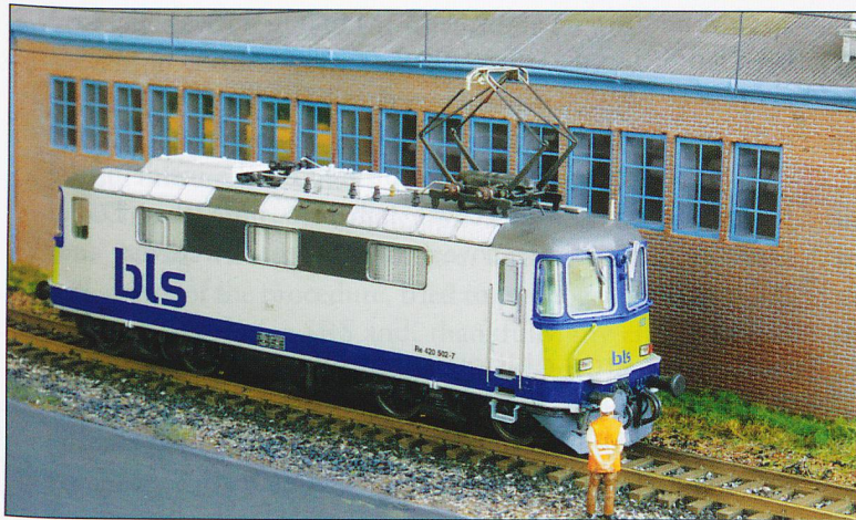
ABOVE: Roco BLS Class 420 stands alongside the shed.