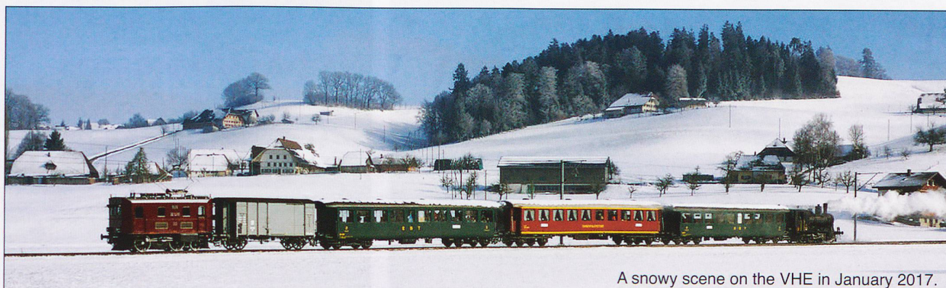
A snowy scene on the VHE in January 2017.