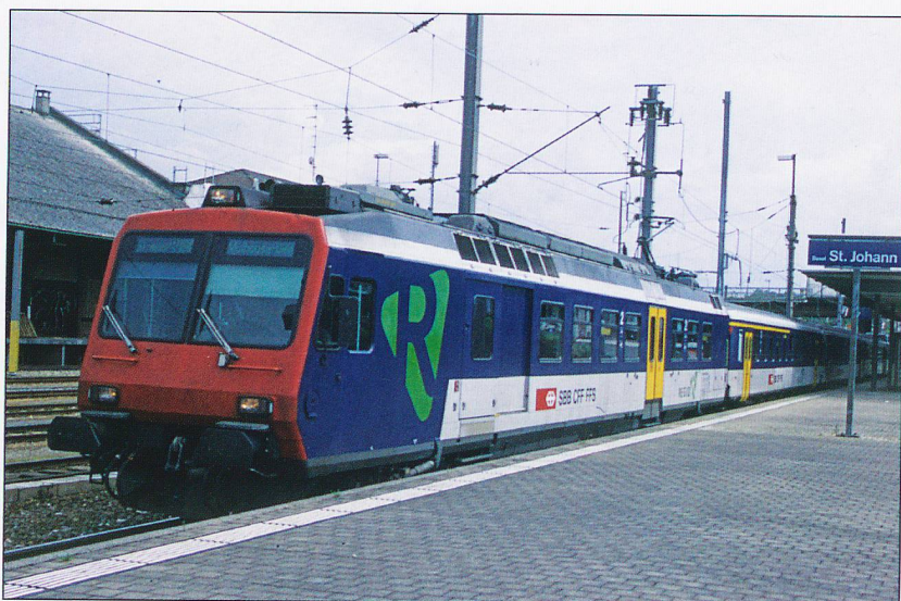
SBB NPZ RBD 562003 in Basel St. Johann under 25kV catenary on 14 June 2010. The large 'R' on the side is part of the corporate identity for the Basel regional network.

between Lausanne and Paris. These units will not be included in the Domino refurbishment. Their driving trailers were renumbered to 29-35 950 to 955.