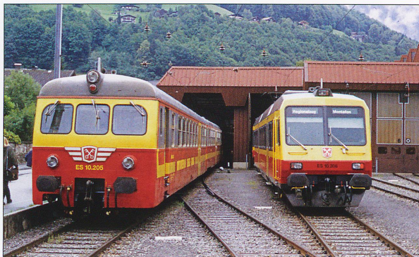
Montafonerbahn NPZ driving trailer ES 10.208 at Schruns depot alongside ex-OBG Transalpin EMU ES 10.205 on 8 July 1998.

SOB NPZ RBDe 561082 departing Rapperswil at the rear of a Voralpen Express destined for Luzern on 22 June 2015.