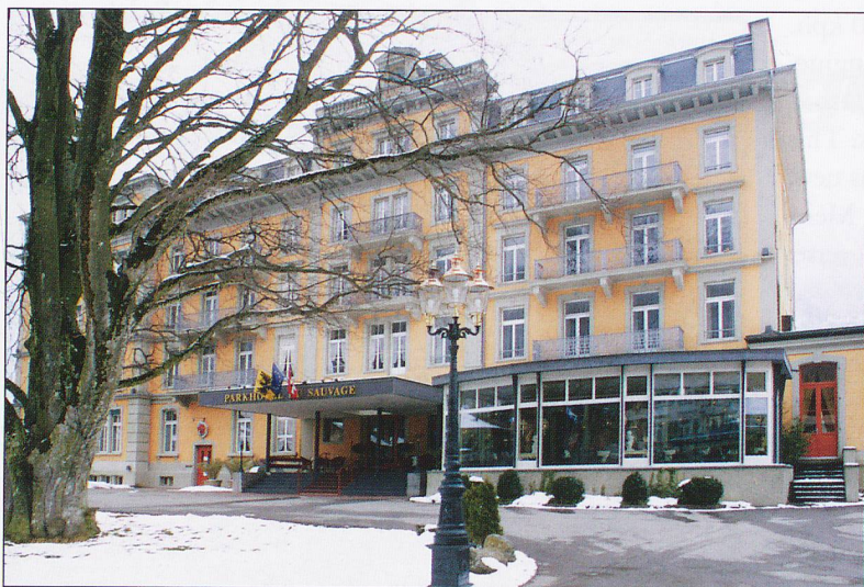
The Hotel du Sauvage, which was the Hotel Engländerhof in Conan Doyle's story, where Holmes and Watson stayed, earlier in the year of the fire.