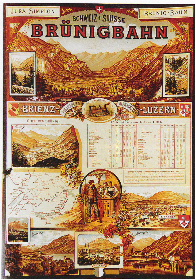
Two pictures of the timetable of 1891 (valid in the fire year) which show the railway only open in summer.

But the standard gauge Bödelibahn remained isolated. Bern – Meiringen - Luzern – Gotthard was no longer a theme. Bern's Luzern line was sold on bankruptcy to a new private railway company the Jura-Bern-Luzern, JBL. Then came a new impulse. The Prussian occupation of Alsace in 1870, closed off